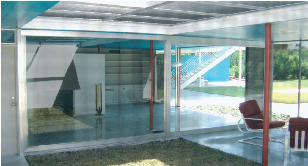
Figure 3: An indoor/outdoor space in Twitchell Rudolph house.

Florida to redefine Florida vernacular in a way that celebrated the region's environmental assets and responded to its climatic challenges.