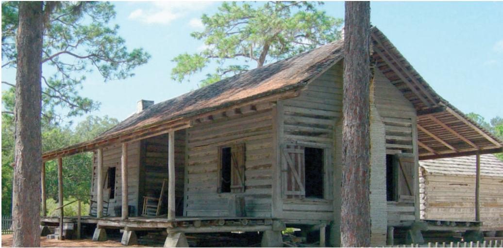
Figure 2: The widdon cabin.

The widdon house has a symmetrical layout with two 5.1 m square rooms and a 3.6 m wide dogtrot between them. Residents had to go outside when moving from room to room, reinforcing their connection with the surrounding environment. Breezes passing through the dogtrot create a negative pressure that pulls air out of the rooms, inducing natural ventilation through the house. A 3 m wide porch runs the entire length of the house on the North and South sides, creating a sense of spaciousness while providing outdoor living and work areas for the residents.