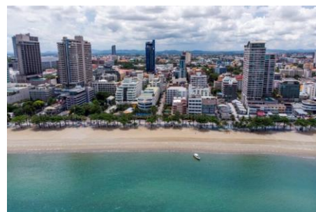
Figure 1. Pattaya City tourist attraction, beautiful beach and clean

Given the tourism potential of Pattaya City, it is crucial to study the application of innovation in its administration and strategic development. This research paper aims to contribute to this area by examining the impact of innovation on the city's strategic development and its potential to become a hub of innovation in the tourism industry. Figure 1 shows the top ten nations' rankings by the UNWTO, which reflects Thailand's significant tourism potential.