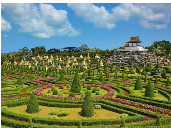
Figure 3. Nongnooch Tropical Garden

Moreover, theoretical frameworks like the knowledge-based view of the firm or the dynamic capabilities perspective that emerged since then have offered many new ways of theorizing about innovation. All of these developments have led to a fragmentation of the innovation literature, so that its present state is characterized by many inconsistencies, competing theoretical frameworks, diverse conceptualizations of the determinants of innovation, and knowledge gaps [31-33]. Many studies have sought to understand the innovation process, but scholars have not yet been able to identify a clear prototypical process for the management of innovation [34]. Second, the vast majority of innovation research conducted on the organizational level of analysis has concentrated on three domains: (a) the identification of antecedents that affect the extent to which an organization is successful at technical innovation (Figure 3); (b) studies of the development of new products and/or new businesses within the established organization with a focus on authenticity-ambidexterity; (c) the impact of interfirm linkages on various types of organizational innovation [34]. This specificity seems problematic since many questions pertaining to the strategic management of innovation are still little understood, such as the relations between innovation, resources, and performance [35-38].