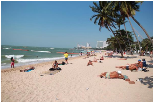
Figure 2. Visitors visiting Pattaya City from around the world including senior citizens stay forever

Hence, the term "city of tourism innovation" refers to a provincial-level tourism administration that leverages innovation from other industries in the area to develop the tourism industry in the region, thereby increasing its competitiveness and efficiency. This, in turn, promotes local employment and fair income distribution [2].