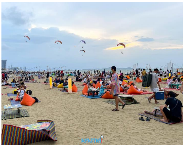
Figure 4. Pattaya City Reclamation Innovation

management focused on the acceptance of diversity in nationalities, religions, and cultures (Figure 4). Moreover, to arrange for the tourism that mixed between sciences and social science which had much influences on the strategic development of Pattaya City. This conformed to process innovation that Pattaya City had the policy to build tourist attraction with diversity and to arrange for the amusement activities and new forms of sport, including public communication with the society. This promoted good attitude of visitors toward Pattaya City. On the part of product innovation applying into the administration, since Pattaya is the tourism city with tourism attractions and other compositions related to tourism, thus it is very important.