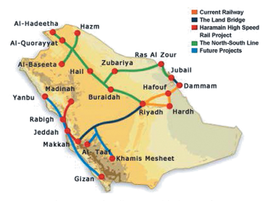
Figure 3: Intercity railway network in the KSA [6].