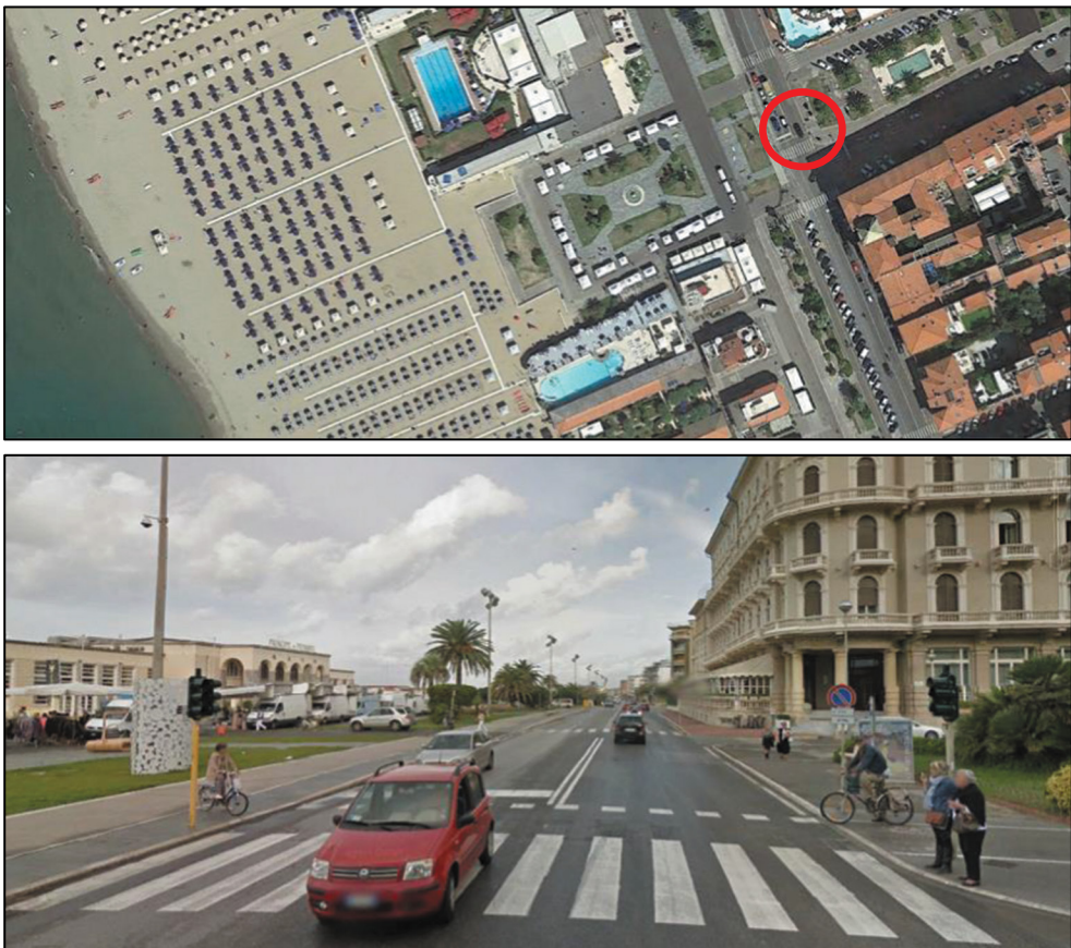
Figure 2: Aerial (top) and ground level view (bottom) of the research location in Viale Carducci, Viareggio, Italy.

The statistics from the observed data show that overall 289 pedestrians crossed the avenue at the signalized intersection (52.2% male, 47.8% females). Dividing them by estimated age, we found 62 pedestrians were under 20 years old (21.4%), 128 between 20 and 40 years old (44.3%), 87 between 40 and 65 years old (30.1%) and 12 over 65 years old (4.2%). Classification by age is showed in Table 1. More than three quarters of the pedestrians walk and cross in groups of two or more persons (76.5%) and the remaining pedestrians cross alone (23.5%).