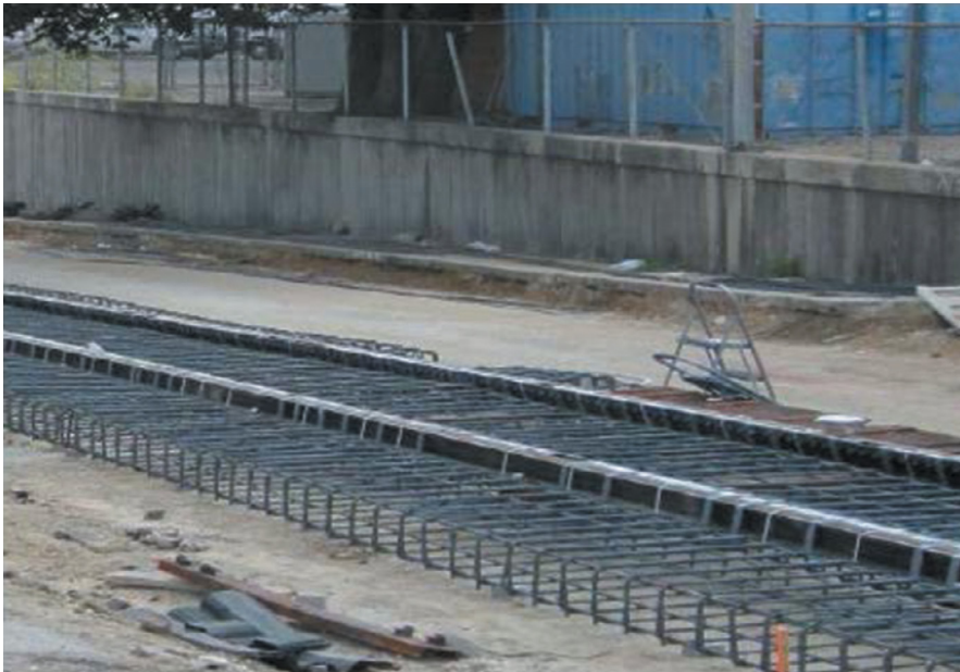
Figure 3: Reinforcement steel and collection mat for embedded track.

Collection mats are used to intercept and retain stray current on embedded track sections which are laid on concrete slabs with steel reinforcement such as those in tunnels and viaduct. A stray current collection mat in these instances provides a low-resistance path to intercept and retain the stray current leaving the rails. These collection mats are continuously bonded together along their length to provide the stray current with a low-resistance path (Fig. 3) (Tzeng & Lee [12]).