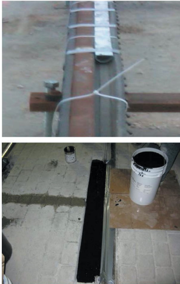
Figure 2: Rail boot (Memon & Fromme [10]) and sealing compound replacing rail boot.

way back for the current to the substation is through the ground which contributes to the current leakage. Therefore, yard tracks are isolated from the main track and are provided with a dedicated substation.