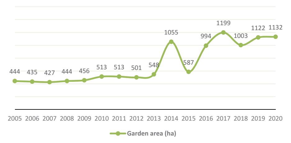
Figure 2: Kitchen garden area (ha) throughout 2005–2020, Data source: KAS, 2021.

Years 2014 and 2017 show a more distinct increase of kitchen garden area (1,055 and 1,199 hectares, respectively), but at the same time are characterized with higher unemployment (35.3% and 30.5%), as well as urban and rural poverty rates as compared to the preceding or succeeding years as shown in Table 1. This could imply that people losing their livelihoods and spending more time at their homes may engage more with home gardening