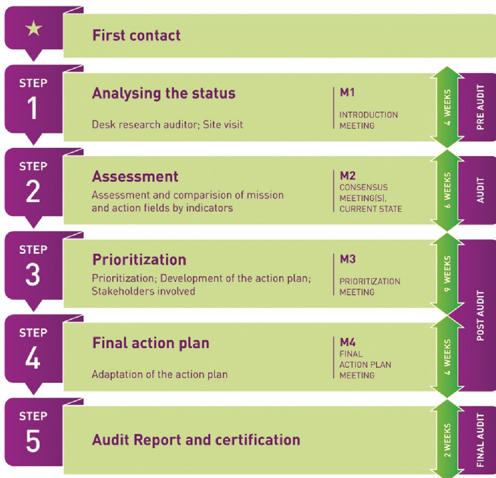
Figure 3: ADVANCE audit scheme.

A meeting between two certified auditors and the town representatives was organized. The auditors clearly explained their role as facilitators of the audit process and described the necessary capabilities and resources that were required to compose the ADVANCE working group. Special emphasis was put on the involvement of relevant stakeholders. The auditors collected context indicators, researched the relevant city documents and carried out a site visit to the city, which helped to determine the baseline situation of the city.