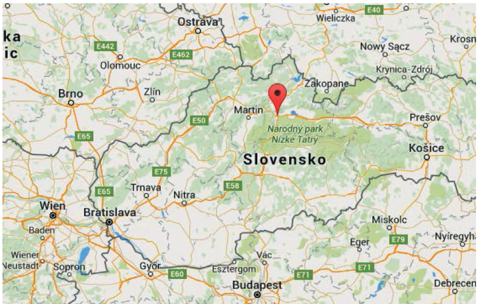
Figure 2: Location of Ružomberok.

Ružomberok started to develop its SUMP in September 2015 and the work will continue during the first half of 2016. The first step was independent validation of its urban mobility performance and sustainability by ADVANCE audit. The aim of the audit is to assess and improve the quality of the mobility planning and policy in the city, as well as to analyse, systemize and improve the whole process of the development of the SUMP. These 'process' elements are analysed by the Mission Fields; the implementation of measures and actions in the city is analysed by the Action Fields. The process follows five steps as represented in Fig. 3.