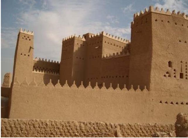
Figure 6. Restored palace in al-Diriyah (left) and Al Gaat (right)

Another example of the traditional buildings that have been restored and rehabilitated by the Saudi government is the well-known Al Masmak Palace. Builders used local and traditional building materials and architectural features. Besides, the Saudi governor's palace in Najran has been restored with its all interesting architectural features. (Figure 5) [9].