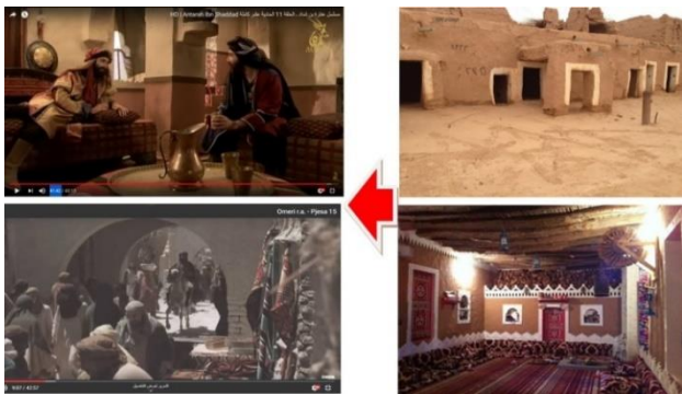
Figure 2. Ayoun al-Jawa, as a museum that represents the style of life in the old times

The conservation of Architectural heritage in Saudi Arabia through emerging economic planning has a remarkable influence on total development economy. However, this promotes creating new jobs in the different governmental organizations and improves tourism of the country [11].