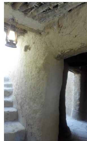
Figure 11. Thick walls with mud plaster as a common feature of Sudair buildings

An interesting tour from shade to sun to shadow can be seen easily in the village. This journey takes the person from open paved streets to narrow ones, and then passes through shaded internal roads with a clear difference between the temperature between open streets and shaded streets and the interior spaces of different buildings. (Figure 12).