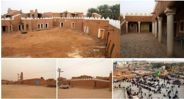
Figure 1. The architectural heritage in the village of Ayoun al-Jawa

Different buildings, sites, villages had been restored for a new use or for the sake of taking care of the architectural heritage. An example of such preservation efforts is the village of Ayoun al-Jawa (Figure 1). It became a museum that represents the style of life in old times as a trip through time (Figure 2) [3].