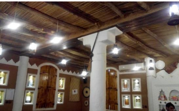
Figure 13. The wood is used for windows, doors, and roofs in Sudair traditional buildings

The way to build or erect a roof with wood is through tree trunks. These trunks stand as beams in a parallel way; then, the reed sticks cover trunks in a crossing shape; afterward, both are covered with mud.