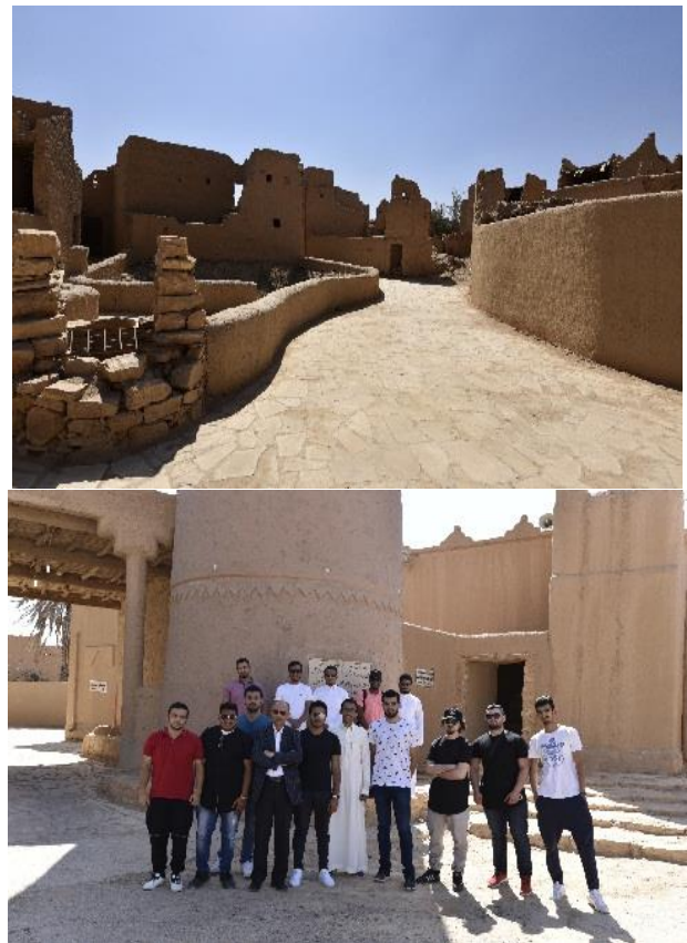
Figure 10. Different types of stone walls, and local streets paved with stones

Further, all architectural features used in the local buildings in their original shapes were preserved as they were in the original shapes: Stairs, pathways, doors, windows, and all other features.