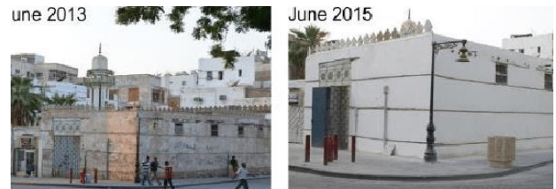
Figure 3. Badeeb House converted to Althyafah Museum before and after

Saudi Arabia preserved many examples of buildings and historical sites. Mostly, conservation used to be done by the government, some of these examples are in Ashager historical village and Ad deriyah, Riyadh. (Figure 4) [13].