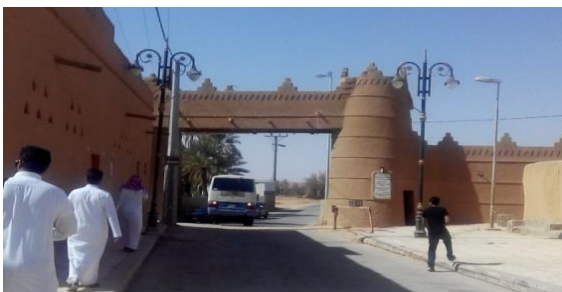
Figure 9. Entrance of the village of Sudair with important towers

Despite the successful efforts put in preserving the historical village of Sudair, awareness of building owners in the other parts of the country is low. This means, more efforts and tries are needed to encourage people to raise awareness about conserving the architectural heritage. Further, this was noticed in other countries where studies show the owners of traditional buildings still have low-level awareness that is uncertain to preserve their buildings. People do not have enough awareness about conservation [8].