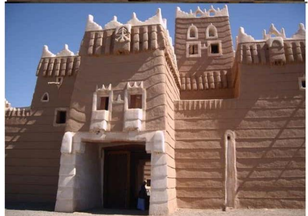
Figure 5. Al-Mašmak Fort in Riyadh and Palace of Saudi governors in Najran