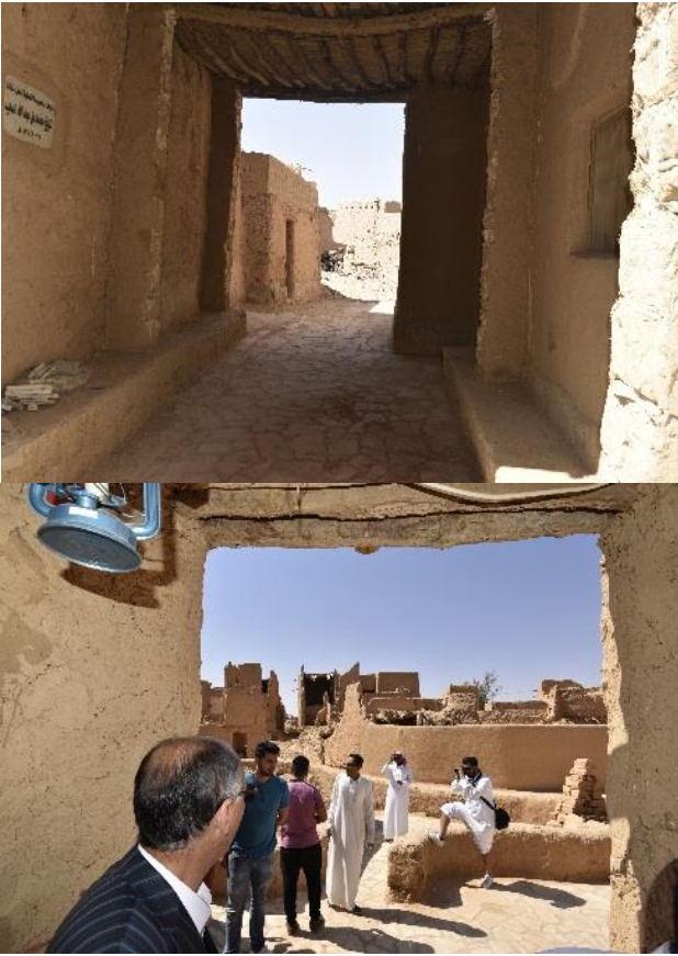
Figure 12. A combination of shaded paved streets and different types of openings