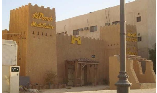
Figure 8. Modern concrete building in traditional style in Riyadh

Further, Saudi governments concentrate on conserving the traditional architectural heritage all over the country. Besides, different ministries, organizations, and bodies made great efforts towards conservation. Also, the private sector did some efforts in preserving such heritage; although these efforts took other forms, such as setting up new buildings with different new buildings material, mostly concrete. In Riyadh one can see new concrete buildings built in the same traditional style, imposing the architectural features like those found in old buildings, copying local styles. (Figure 8) [9].