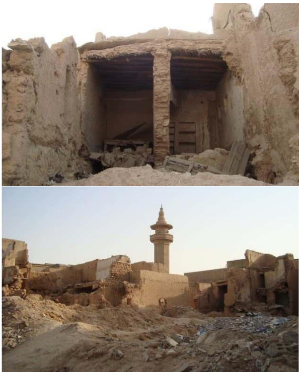
Figure 7. Traditional buildings at al-Dirah in Riyadh

Other examples are found all over the country; some of them are those palaces restored in al-Diriyah, Riyadh, and those in Al Gaat. (Figure 6) [9].