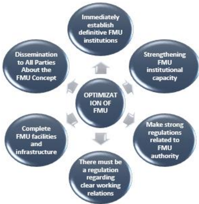
Figure 1. Optimizing the role of future FMUs

To make it easier to find out some steps that must be fulfilled by the Government in order to optimize the role of FMU as a Site Level Forestry Institution in the future, it can also be seen in Figure 1.