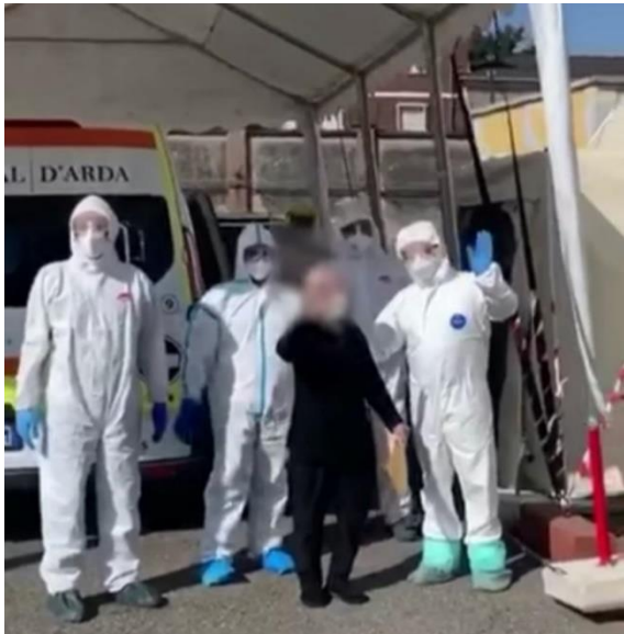
Figure 4. Operators from the Military Field Hospital of Piacenza who accompany the last patient discharged from the hospital to the exit of the dirty area

They were accompanied by the health workers on duty, properly shielded by wearing all the provided PPE (Figure 4).