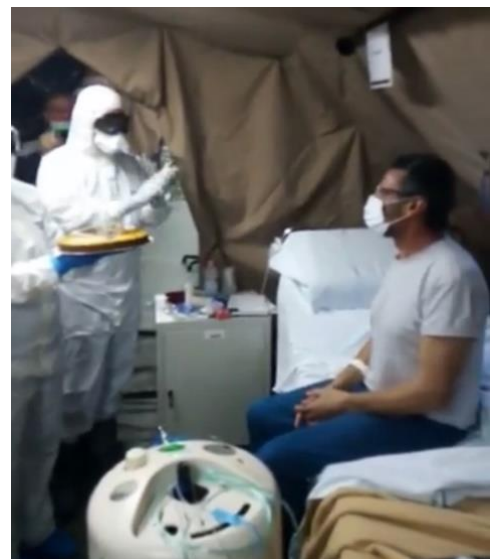
Figure 6. A COVID-19 patient celebrating his birthday with the medical staff on duty

The medical staff within the six hours inside the dirty area also provided a psychological assistance, talking to the hospitalized staff trying to treat the psyche as well as the physical of the patient (Figure 6).