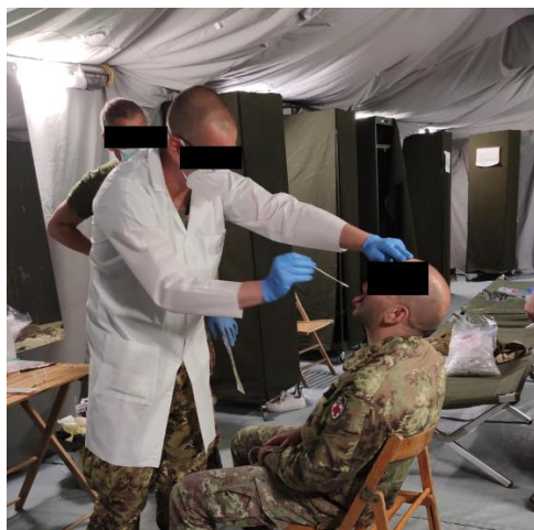
Figure 5. Oropharyngeal and nasopharyngeal swab to a healthcare worker

The swabs were performed before the arrival in Piacenza, 15 days after the first patient entered and 30 days immediately after the exit of the last patient. The last swab was also performed on the logistic staff of the base, with whom the medical staff interfaced in the logistic area for the entire duration of the mission and with whom they also shared the sleeping tents.