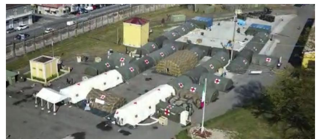
Figure 1. Picture of the area of the Army Field Hospital COVID-19 of Piacenza

provided the support to the health facilities of the most affected city, Piacenza, 15 km away the origin village of outbreak, Codogno (Lodi) (Figure 1).