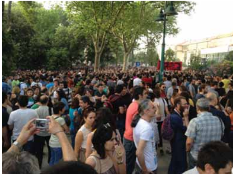
Figure 1: Environmentalists in Gezi Park, Taksim-Istanbul, protesting the reconstruction project of historic barracks by cutting a considerable number of trees in order to build a shopping mall.

international modernism could be mentioned as early steps in the environmentalist agenda spite of being not mentioned in most publications within this context. Although most authors [5] refer to the ‘Silent Spring’ by Rachel Carson in 1962 as the first stone of the green building movement, a much more clearly architectural and urbanism oriented version of it was coined by Lewis Mumford earlier in 1961 as Green Matrix [6]. On the other hand, Austin Green Building Programme in the U.S. claims to have coined the term ‘Green Building’ [7]. The programme has started with residential buildings, but now it also includes commercial buildings. The word green is now also being used in connection with energy and there is even a ‘Shades of Green Energy Radio’ [8]. With all these multiple uses, it would be interesting to find out the approximate point where in the timeline of the Green Building Movement, the word ‘green’ has started to imply to environmental sustainability in reference to the buildings.