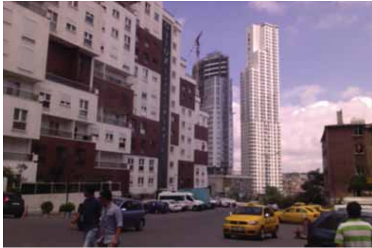
Figure 4: 'A building with terraces enveloped in green!' [35] as advertised (image by EserYağcı, 06/07/2013).