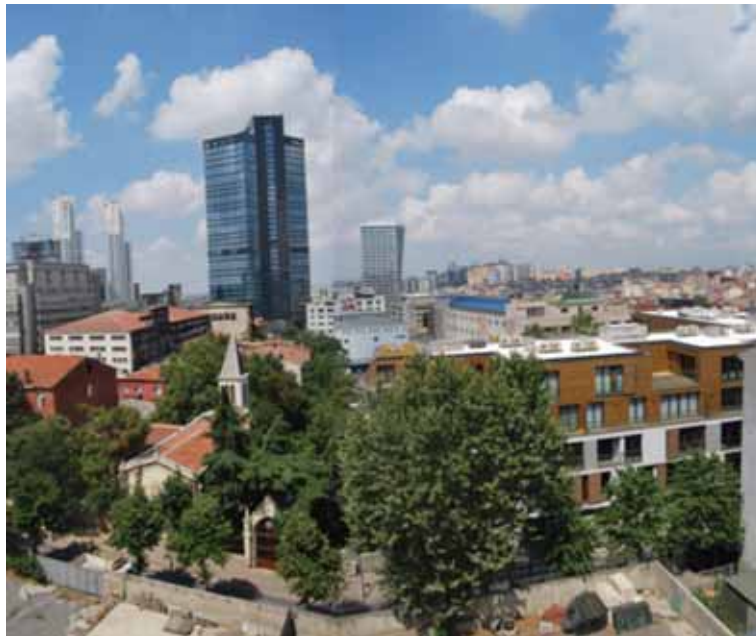
Figure 2: Green architecture built on the green: Tekfen Bomonti Apartments – the tiny square on the left hand of the roof is the referred 'green'.

Indeed, most of the developers in Bomonti use within their advertisements the word 'green' despite destroying it in order to construct their buildings. For example, Tekfen Bomonti Apartments (Fig. 2), actually one of the few, low-built new constructions built with environmental-friendly materials in the district, is standing partly on the former garden of the Georgian Catholic Church.