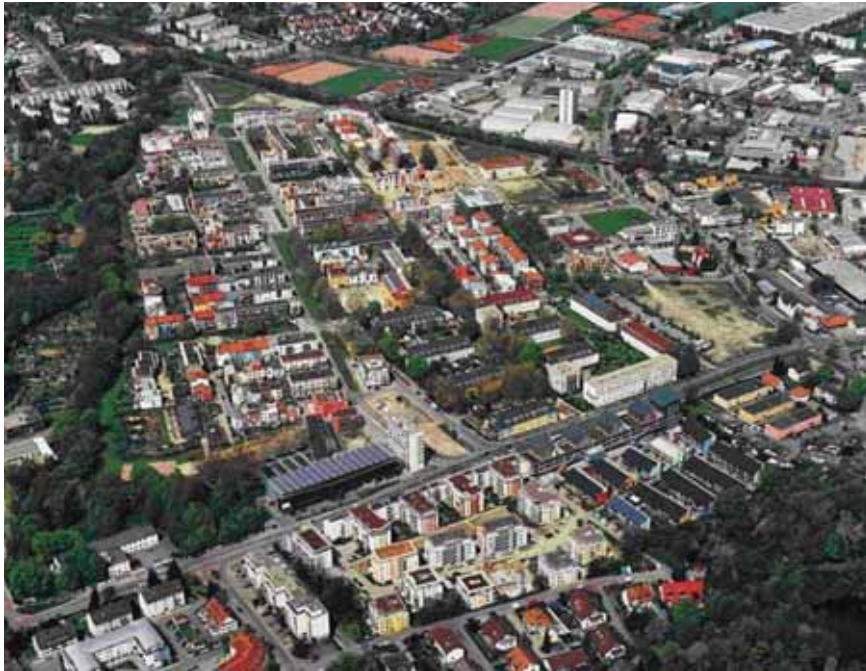
Figure 1: Aerial view of Vauban.

was featured at the 'Better City-Better Life' Exposition held in Shanghai [1]. Every year Vauban is visited by tens of thousands of people from all over the world, including planners, architects, city administrators, students and ordinary citizens, who come to learn about and experience a community that they see as being ecologically, socially, economically, architecturally and technologically sustainable.