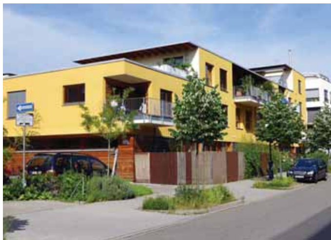
Figure 21: Sonnenhof viewed from Lise-Meltner-Strasse.

As a result of this layout, residents with dementia are visually connected to both the larger Sonnenhof community as well as the surrounding Vauban community. Children from the nearby