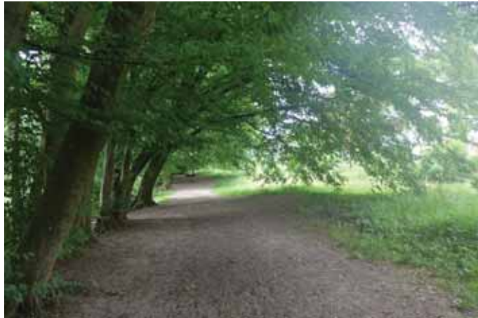
Figure 11: Path along Dorfbach Creek at southern edge of Vauban.