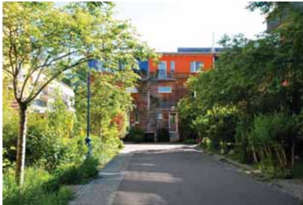
Figure 9: Residential car-free 'play street'.