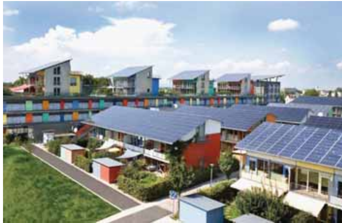
Figure 16: Sonnenschiff viewed from the Solarsiedlung.