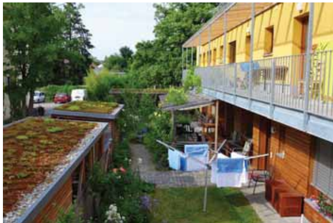
Figure 23: Garden for residents with dementia.

kindergarten, volunteers and family members, a number of whom live in Vauban, make sure that residents are also functionally, as well as visually, integrated into the world beyond by visiting Woge on a regular basis. In Sonnenhof, the architecture and the programmes for support and care were designed together as a single unified whole to create a nurturing community for all residents, including their beloved pets [17].