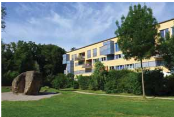
Figure 10: Baugruppe housing along resident designed park.