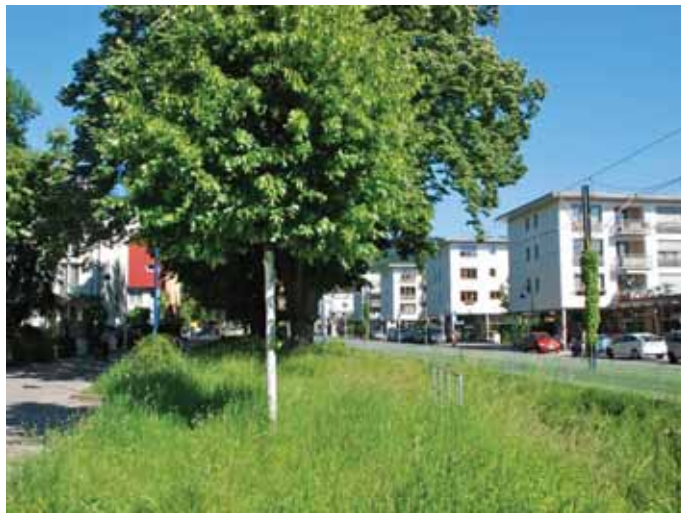
Figure 6: Bicycle and pedestrian paths run along the light rail tracks.

While it is not formally a part of Vauban, a number of child-oriented educational opportunities are located close at hand along Dorfbach creek, including an adventure playground and an interactive animal park, with horses, sheep, pigs rabbits and chickens that children can care for under expert adult supervision. This ‘wild’ southern edge of Vauban is also lined by a number of Passivhaus blocks that look onto the creek (Fig. 12). Here, and throughout Vauban, with its many public parks, numerous mature trees and extensive private gardens, one has the sense that, in spite of its density, nature is always near [6].