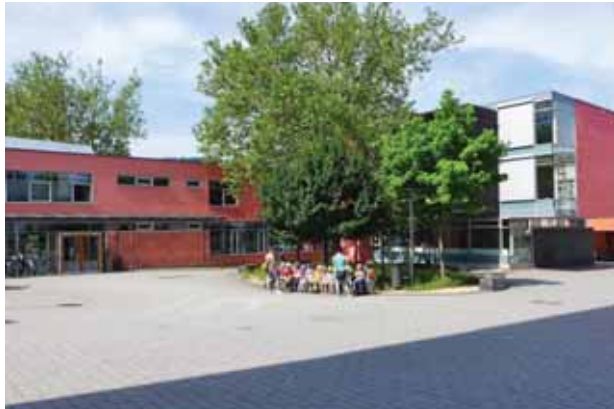
Figure 13: Caroline-Kaspar-Schule and Paula-Modersohn-Platz.