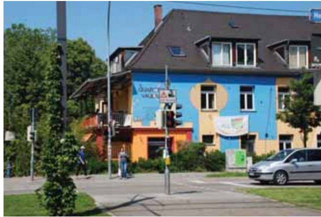
Figure 2: SUSI housing in former barrack along Merzhauserstrasse.