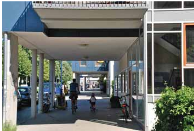
Figure 7: Arcaded shopping street on southern edge of Vaubanallee.