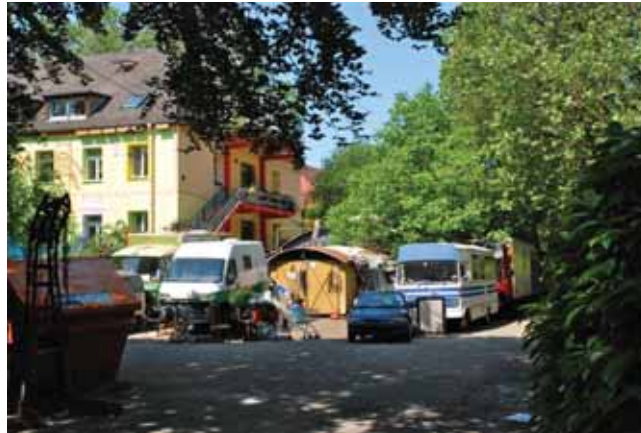
Figure 3: 'Box Car' village as part of SUSI self-managed housing.

group, the Independent Settlement Initiative (SUSI), founded at the end of 1990, also made known their intention to develop an alternative housing community on the site. Therefore, conflict between activist citizens and the city was at the origin of the Vauban development. A compromise was reached that allowed SUSI to rent and eventually purchase four barracks, but this was not the end of the issues the city had to face (Fig. 2). Ever since the French troops moved out, the property had become home to around 100 squatters, called 'box-car dwellers'. While some of these unwanted residents were removed by police, others were eventually integrated into the SUSI project, giving Vauban an architectural and social diversity that it never would have otherwise had (Fig. 3). While the student housing and SUSI communities are technically within the Vauban development district spatially, they were only included within the development plans as an already existing quarter [2].