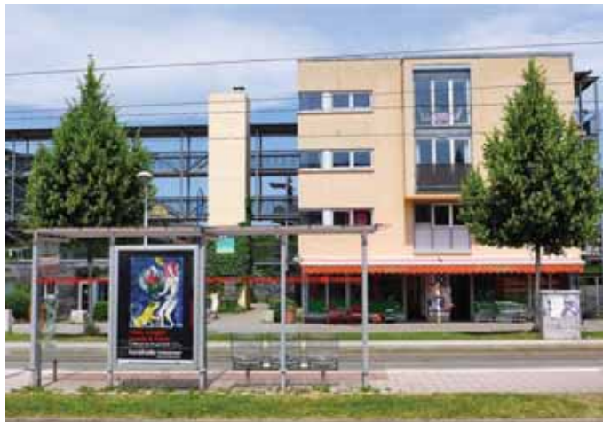
Figure 19: Genova phase 2 located along Vaubanallee.

The Genova project has clearly met its energy and ecological goals. It has better energy performance than the minimum standards for Vauban; a large solar hot water installation; rainwater cisterns