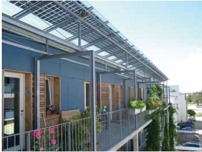
Figure 26: Each apartment is entered from walkways on the north.