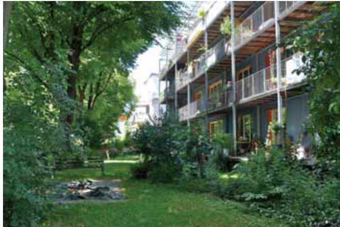
Figure 25: South elevation in summer.