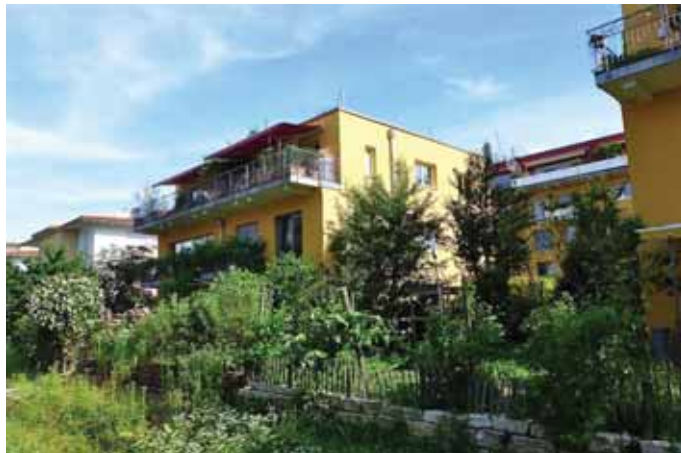
Figure 12: Passive solar houses along the Dorfbach Creek walking path.

Vauban has four kindergartens and the Caroline-Kaspar-Schule, a primary school, which is also designed to be used as a community meeting center. In front of this school is Paula-Modersohn-Platz, which connects the school to a major transit stop as well as a grocery store and other businesses along Merzhäuserstrasse (Figs 13 & 14). Thus, children in Vauban are placed in the middle of urban life as well as being offered a variety of green play spaces and more remote natural areas.