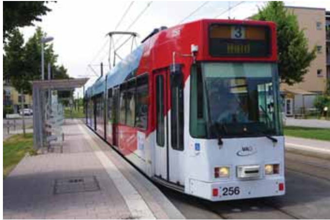
Figure 18: Vauban station with light rail and bus connections.

the light rail stations in the district and interchange connections by bus and rail allow access without a car to any part of the city, the region and beyond.