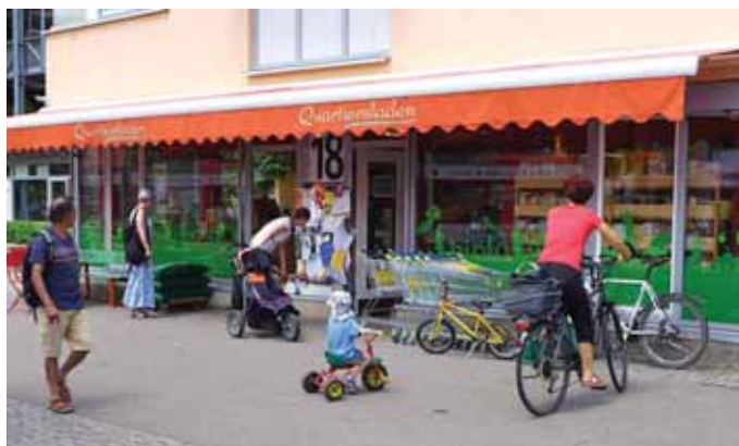
Figure 20: Whole foods store operated by Genova on Vaubanallee.