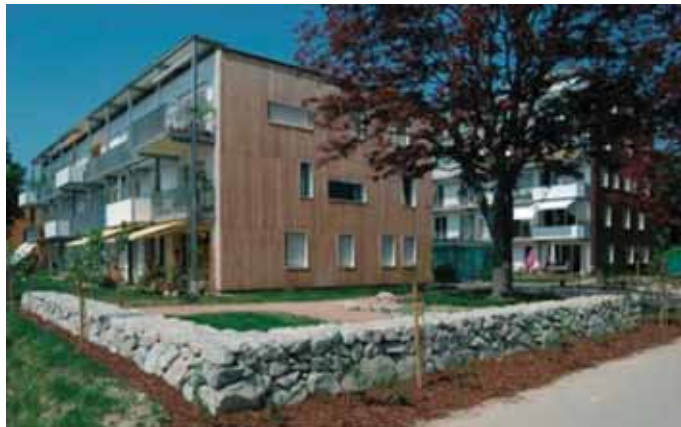
Figure 27: Klee Häuser viewed from the south.

successfully applied in Wohnen und Arbeiten , as well as the purchase of carbon emission credits from a nearby wind farm, Klee Häuser has been able to meet the stringent Swiss 2,000 Watt Society requirements to create an energy-efficient, zero carbon building [25].