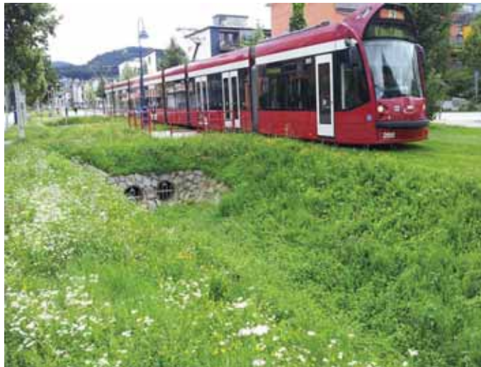
Figure 5: Vauban's light rail tracks are set in a green bio-swale.

These neighborhoods are separated (and also joined) by five resident designed parks running roughly north–south that connect with the walking trail along Dorfbach creek, a natural area bordering the south edge of Vauban (Figs 10 & 11). Not only do these parks serve as play and recreational