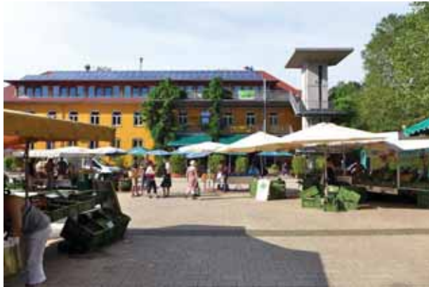
Figure 8: Haus 37 and Alfred-Döblin-Platz.