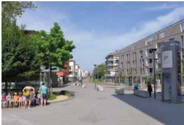
Figure 14: Paula-Modersohn-Platz and light rail stop.