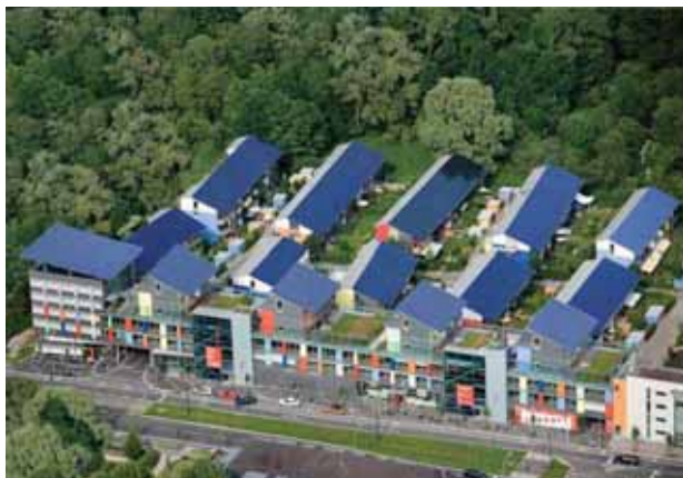
Figure 15: Plusenergie® Solarsiedlung am Schlierberg.