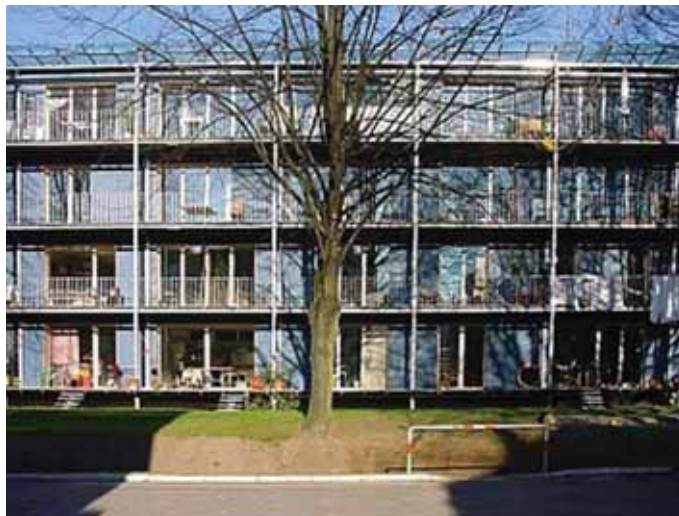
Figure 24: South elevation in winter.

The high thermal mass construction used for interior walls and the precast concrete floors absorb and store solar energy from south-facing windows and, in the summer, provide cooled mass as a result of night-time flush ventilation. A small natural gas powered CHP (12 kWh peak) unit, supplemented by roof top photovoltaics (3.2 kW peak), provides 80% of the electrical needs. Fifty square meters of rooftop solar hot water heaters, combined with hot water from the CHP system, provide all of the space and water heating for the building. This project demonstrates that it is possible to achieve a 79% reduction in primary energy use, including electrical power, with only a modest 7% increase in initial construction cost. Altogether, this building reduces greenhouse gas emissions by 80% compared with conventional new construction [21].