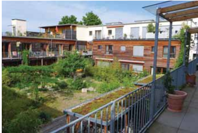
Figure 22: Sonnenhof courtyard viewed from the office block.