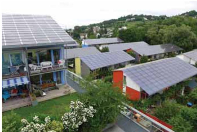
Figure 17: Solarsiedlung, view from Sonnenschiff penthouse.

to three-storey row houses from street noise. It is occupied on the ground floor by a bank and a variety of retail enterprises, such as an organic grocery store and a pharmacy. Offices, including that of Rolf Disch, Architects, are located on the upper floors. The structure is topped with four three-storey passive solar penthouses, opening onto gardens and terraces facing south [7].