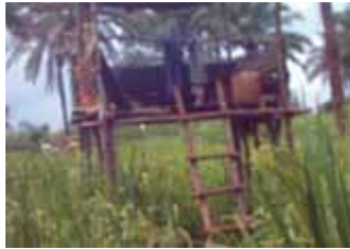
Figure 1: A typical scaffold used in scaring birds in a rice field in Igbemo. The structure is usually built on stilt and suspended to about 2.4 metres above ground level. It creates a platform where the rice farmer oversees his farm. There the farmer sits with a catapult (slingshot) which is used to scare the birds as they arrive in their thousands. This operation requires much effort and timing otherwise, the farmer may lose the whole rice field to birds. However, it is a partially effective method.