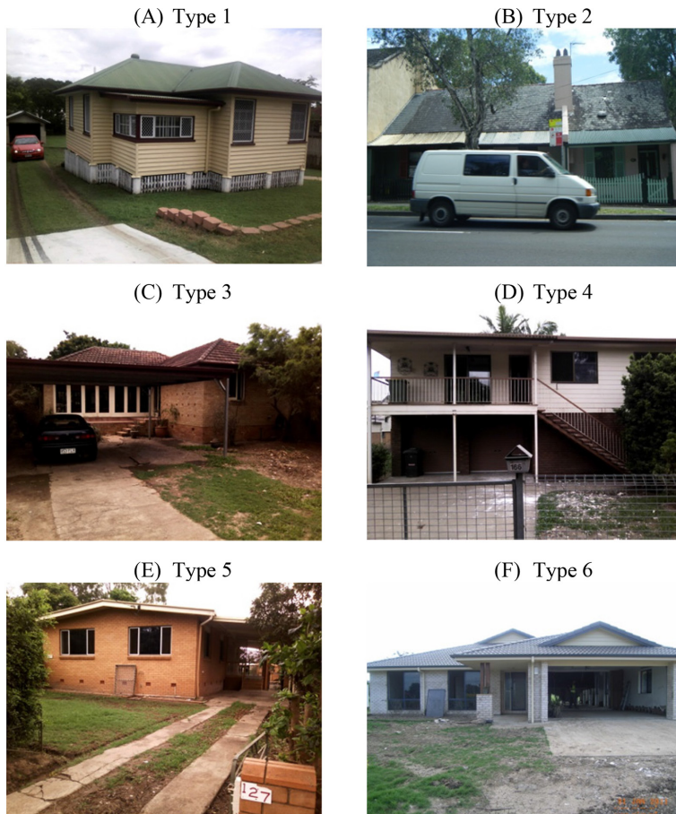
Figure 4: Selected typical residential floor types.

A limited number of typical residential storey types have been selected for the balance of the research which are based on the schema proposed earlier in this paper. Fig. 4 presents the six floor types for which retrofit strategies will be investigated. Key characteristics of these floor