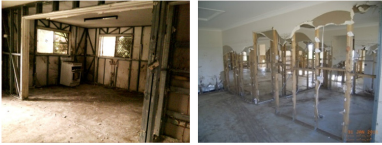
Figure 1: Examples of building damage after 2011 Queensland flooding.

the opportunities for reducing the vulnerability of Australian residential buildings to flood [4]. It addresses the need for an evidence base to inform decision making on the mitigation of the flood risk posed by the most vulnerable Australian building types. This project investigates methods for the upgrading of existing residential building stock in floodplains to increase their resilience in future flood events.