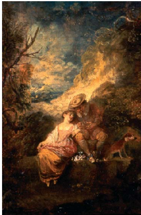
Figure 3: Antoine Watteau, The Robber of the Sparrow's Nest , Courtesy of the National Gallery of Scotland.

artists who hoped to emulate the distinguished effects of the master paid particular attention to nuanced shading of impressive figures clothed in rich robes or well cut suits. Painters did not realise that the very medium in which they worked would eventually foil this ambition. Most of the original careful modelling of dark-clad figures, many details of clothing, most differentiation of texture, subtle changes of tone and colour between figure and dark background, can now only be discerned in infra-red photographs or X-rays. No amount of dirt or varnish removal from these thinly painted blacks can restore the painter's original effects of mass and volume, which continue to degrade. There is little that a conservator can do about this situation.