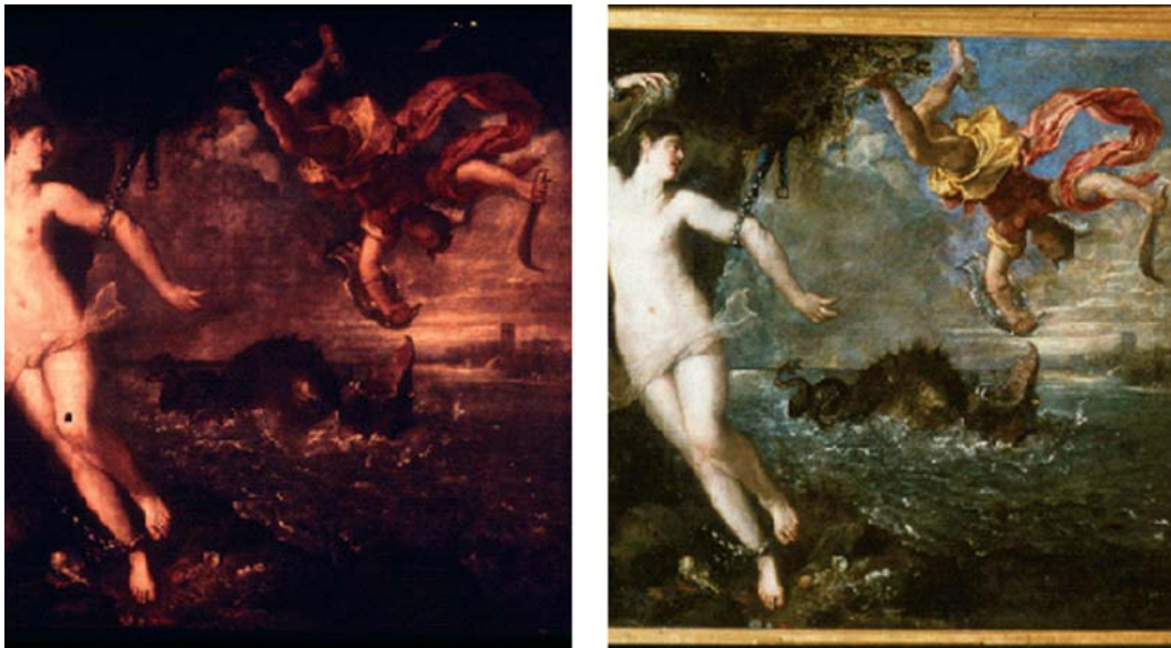
Figure 2: Titian: Perseus and Andromeda , (1553–1562; Wallace Collection London), before cleaning (left); after cleaning (right).

down brilliant primary colours. An extensive, and at times virulent, discourse about the relative propriety of total or partial varnish removal raged during the 1960s [7] between conservators and art historians, echoing concerns that had been voiced about varnish removal in the early years of the National Gallery, London in the 1840s and subsequently in the 1930s [8]. Whatever its original purpose and appearance may have been, varnish does alter over time, becoming dirty, more opaque, darker, bloomed or crackled. As it ages, varnish browns. Deteriorating varnish obscures the original colours and, like grey dirt, it is particularly detrimental to blues, clear yellows and other cool or bright colours. It obscures the state of the paint layer from scrutiny, and inhibits accurate art historical observation, analysis and judgement.