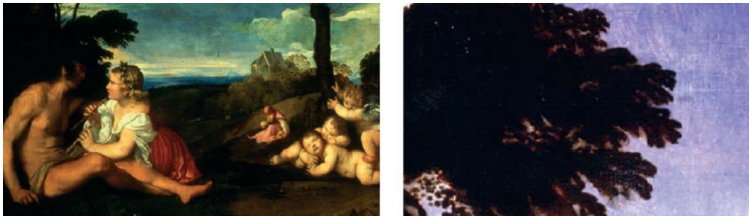
Figure 5: Titian (Tiziano Vecelli), Three Ages of Man, on long term loan to the National Gallery of Scotland, before cleaning (left); tree – after cleaning and varnish removal (right).

Eastlake had great authority in 19th century Britain as a Director of the National Gallery of London, Secretary to the Fine Arts Commission, scholar, and as a professional painter. Many followed dictates laid out in his texts on painting technique: