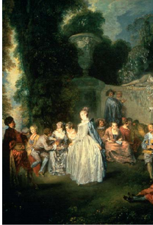
Figure 4: Antoine Watteau, Fetes Venetiennes , Courtesy of the National Gallery of Scotland.

light, pure green to a deepening brown ([13], p. 73–75). When Titian's early work in the NGS, The Three Ages of Man (1513–1514) (Fig. 5) was cleaned and dirty varnish removed, subtle, cool colours in the clear blue sky and misty landscape background were revealed.