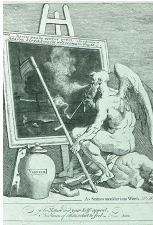
Figure 1: William Hogarth, Time Smoking a Picture

If art historians are to make informed judgements about colour in paintings they need to understand that the appearance of most works of art has changed since they were first made, and that colour is one of the major aspects which may have substantially altered over time.