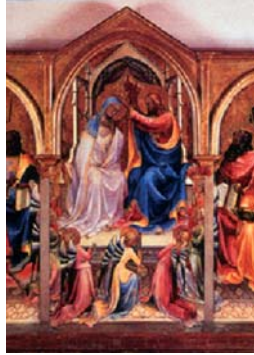
Figure 6: Lorenzo Monaco, Coronation of the Virgin , Courtesy of the National Gallery, London. Copyright National Gallery, London.