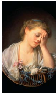
Figure 7: Jean-Baptiste Greuze, Girl Mourning a Dead Canary

exhibited that year in the Paris Salon, where it created a great stir and was immediately written up in an enthusiastic review by Diderot. (Denis Diderot (1713–1784) was a prominent French writer, encyclopaedist, philosopher and influential art critic in the Enlightenment.) Two and a half centuries later the picture features a bird that is grey, not yellow, among blue foliage. It is clear that a semi-transparent, uniform semi-transparent glaze of fugitive, vegetable yellow had been laid over a monochromatic modelling of the form of the bird to produce yellow, and over the blue modelling of the leaves to give an optical reading of green, but it is also clear that this yellow has been affected over the years by light. The yellow pigment can only now be identified by chemical analysis. The painting was fully described by Diderot in the year it appeared at the Salon, and we can deduce that Greuze had used an unreliable pigment: seduced no doubt, like so many artists in the 18th century, by the clarity, purity and intensity of the yellow offered by the colour salesmen. Many bright pigments proved susceptible to ultraviolet rays and faded in sunlight.