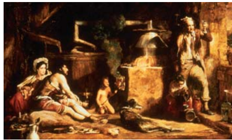
Figure 8: Sir David Wilkie, The Irish Whisky Still