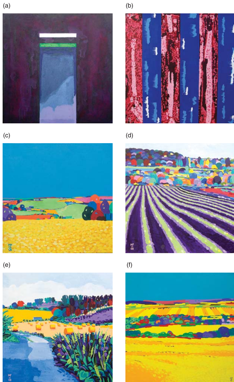
Figure 1: Examples of abstract and landscape paintings. (a) Day 1 from Days of Creation (600 × 600 mm, acrylic on board). Photo by Tanya Uroda. (b) Day 3 from Days of Creation (600 × 600 mm, acrylic on board). Photo by Tanya Uroda. (c) Meopham (50 × 50 mm, acrylic on canvas). (d) Farm 2 (Cliffe) (500 × 500 mm, acrylic on canvas). (e) Harvest (Betsham) (500 × 500 mm, acrylic on canvas). (f) South Darenth (800 × 800 mm, acrylic on canvas).