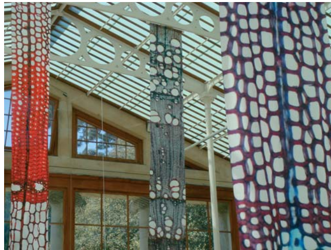
Figure 1: Canopy , Nash Conservatory Kew, detail view of installation, 2008.

today was fuelled by such images. However, nowhere are the ‘contradictions and fissures’ [2] more apparent than in the catalogue essay for Garden Eden [3], a historic survey of botanical illustration, where Prof. Dr H. Walter Lack, director of the Botanic Garden in Vienna, informs us that: