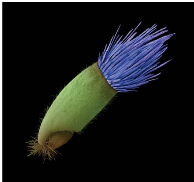
Figure 3: Cornflower , 2006. Courtesy of the artist, Wolfgang Stuppy and Papadakis, London.

The use of colour is not however, arbitrary. In the image of a cornflower seed (Fig. 3), the colour is in part informed by the colour of the original flower, but is also used to highlight the dispersal tactics of the seed. The blue feathery tufts expand and contract with changes in humidity moving the seed along the ground and the brown part at the base, the elaiosome is attractive to ants as food.