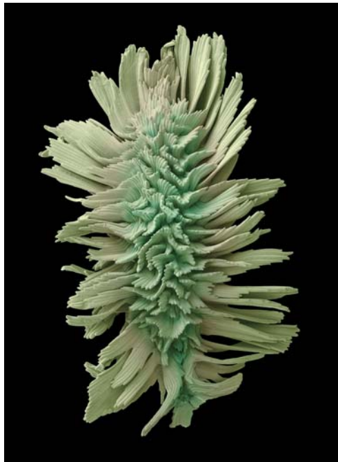
Figure 5: Cymicifuga , Courtesy of the artist, Wolfgang Stuppy and Papadakis, London.