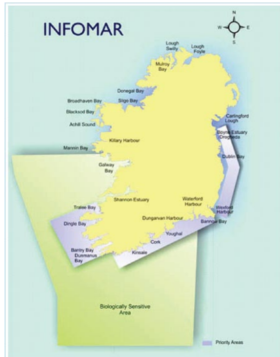
Figure 3: Location of 26 priority bays, three priority areas and the Biological Sensitive Area designated under the EU's Common Fisheries Policy.