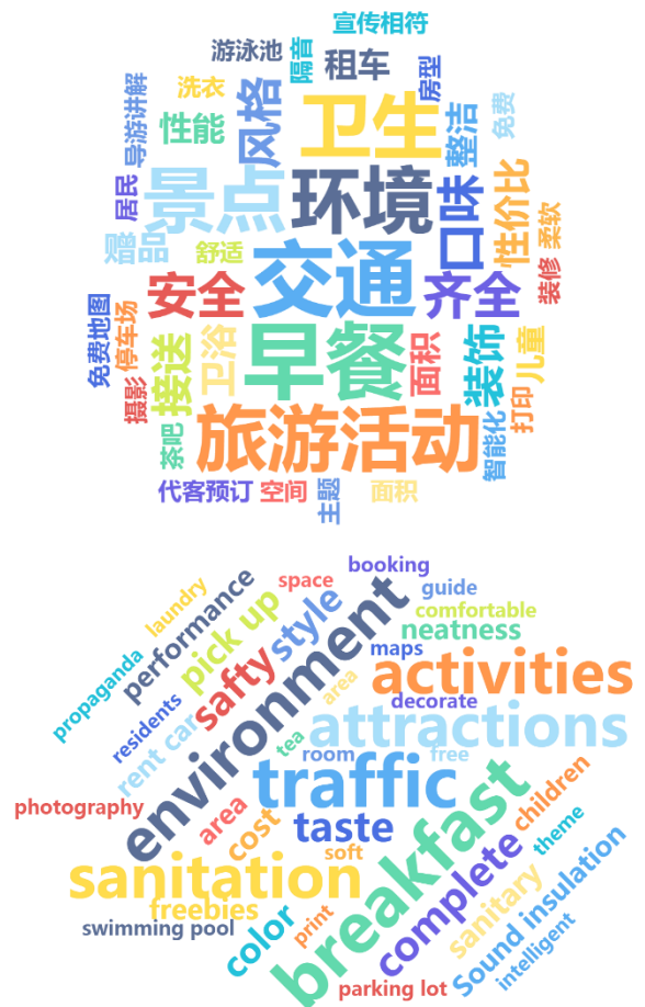
Figure 1. Word cloud of high-frequency nouns in RHI reviews

Duan et al. [28] extracted frequently occurring nouns in reviews as candidate features of hotels. In this paper, the high-frequency nouns in RHI reviews are obtained through text corpus analysis. As shown in Figure 1, the homestay tourists were mostly concerned about traffic, breakfast, environment, attractions, sanitation, activities, etc.