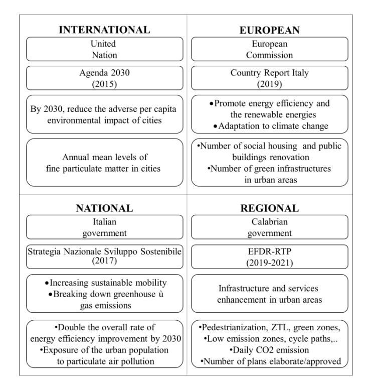
Figure 1. Public actors, main strategic documents, targets and indicators

It can be noted that there are not specific financial programs that link strategic goals to operative results. The lack is greater because the final decision maker are cities and town but don't have specific grants, with administrative and technical guidelines. In this empty between strategies and real implementation, the Calabria Region construct a bridge: firstly, defining the region role and then designing a political, technical and administrative path to obtain the results.