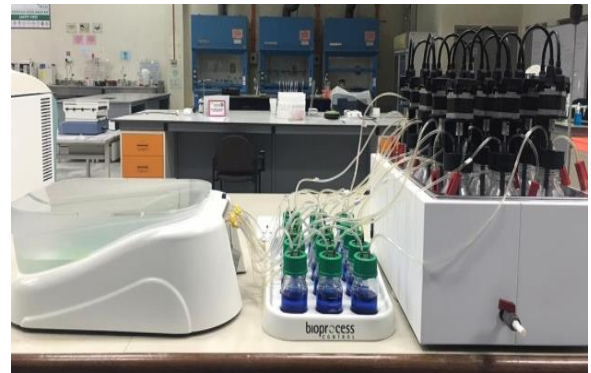
Figure 1. Automatic Methane Potential (AMPTS II)

inoculum to substrate (I/S) ratio of 2 was selected [11, 13]. The mass of the substrate and inoculum in the reactor was calculated accordingly to VS (in %) [26]. Then, the anaerobic environment was created by purging the pure nitrogen gas for two minutes [21]. Consistently, reactors were remained at mesophilic temperature (35 ± two °C) and were automatically stirred at 90 rpm for 10s every 1 min [16].