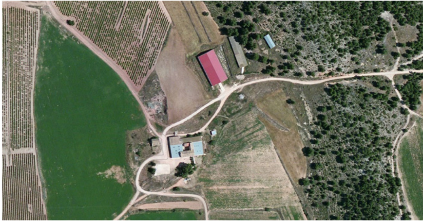
Figure 2: Industrial unit installation for a wine cellar, through a statement of community Interest in rural land, township of Ayora (Valencia).

an SCI proceeding is 1 year, but can be extended to 2 years, without considering other possible proceedings being included, as explained above.