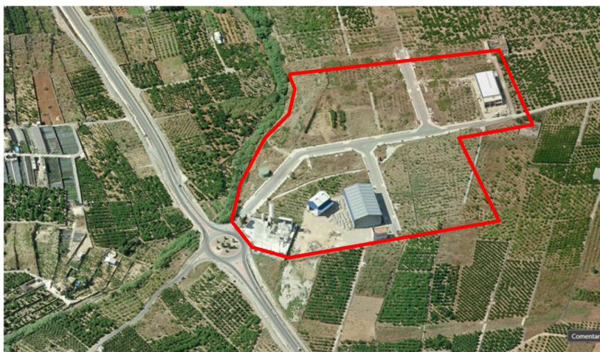
Figure 3: Industrial units in a new industrial park in developable land in the township of Ador (Valencia) with different environmental control processes based on the activity level of impact.