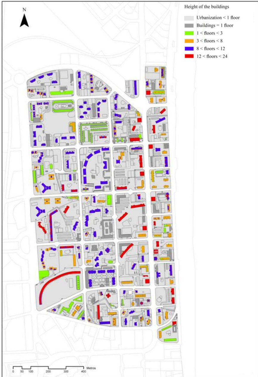
Figure 2: Analysis plan of the height of the buildings within the San Juan Beach study field (Alicante).