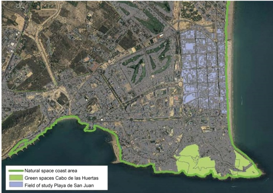
Figure 4: Strategy 1 analysis plan. High-impact green spaces in the area, related to our field of study, San Juan Beach (Alicante). Marked in blue.

phology as a working tool, Strategy 3: Urban mobility as an inherited right, Strategy 4: Natural resources as food bank in crisis, Strategy 5: Social structure as a guarantee for urban management, Strategy 6: The economic model as a driving force for change, Strategy 7: Governance as a re-balancing tool. The following illustration provides an example of the analysis of strategy 1, Urban land as the physical basis of the transformation, within our field of study (Fig. 4).