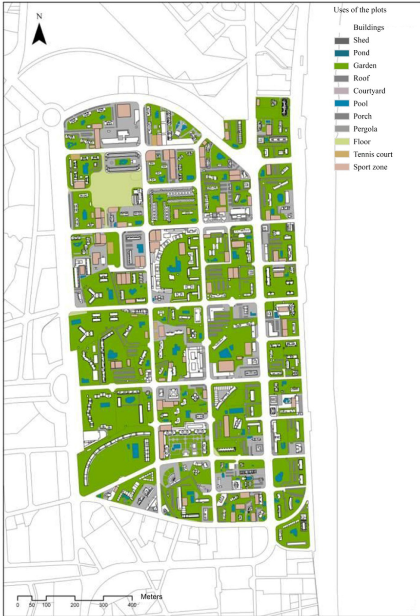
Figure 3: Analysis plan of the uses of the plots within the field of study of San Juan Beach (Alicante).