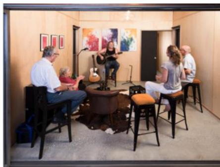
Figure 5: Performance + exhibition space.