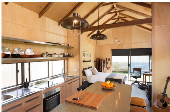
Figure 9: Writer's + residential space in '12 Blues Bar' built at 88 East Street, Clifton.