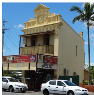
Figure 2: 48 Enoggera Terrace, Red Hill, Brisbane.