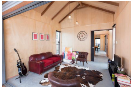
Figure 4: Writer's + residential space.