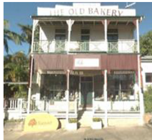
Figure 1: ‘The Old Bakery’ Eumundi, Queensland.

A home workhouse is fundamentally a small-scale mixed use building, which are otherwise known these days as ‘live-work dwellings’ eloquently described by Duany et al. [13] in the ‘Smart Growth Manual’, and also the focus of Dolan [14] who asserted that live-work buildings could result in a ‘zero commute’.