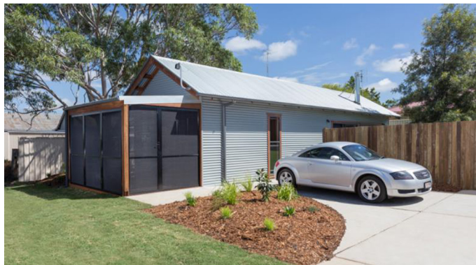
Figure 8: Oblique view of '12 Blues Bar' built at 88 East Street, Clifton.