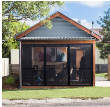
Figure 7: Front view of '12 Blues Bar' built at 88 East Street, Clifton (image © Cian Sanders).