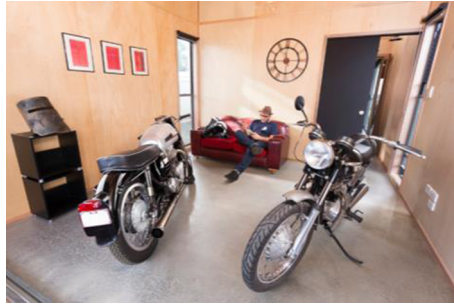
Figure 6: Workshop + storage space