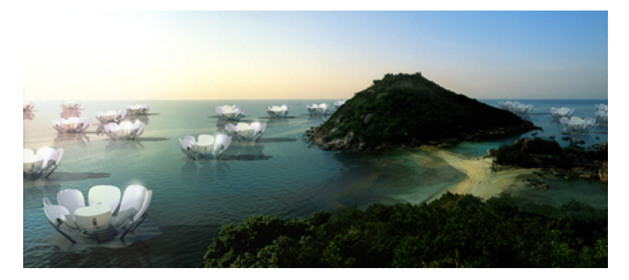
Figure 2: Giant Water Lilies (the Why Factory, 2008).