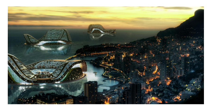
Figure 3: Lylipad (Vincent Callebaut Architecture, 2008).