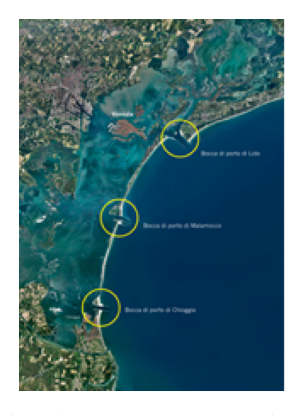
Figure 5: MOSE (MIT, 2003 – ongoing).

Micro-Utopie, by iaN+ and Marco Garofalo, 2003 [26], is based on the characteristic of adaptability that have the aircraft carrier to be offshore bases strategically positioned on the globe, for transform them into elements capable of supporting the needs of cities in case of risk. The functions can be different: artscape, housescape, sportscape, and landscape (Fig. 1).