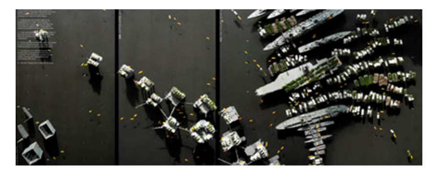
Figure 8: Flooded London (Anthony Lau, Bartlett School of Architecture, 2008).