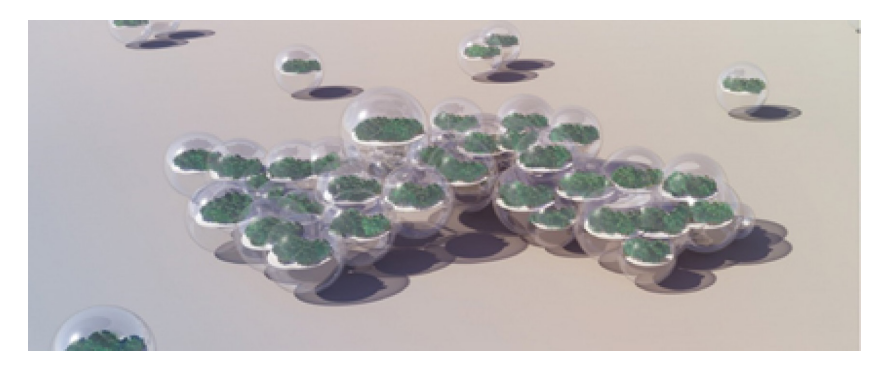
Figure 9: I-City/We-City (the Why Factory, 2012).

design research tries to solve the situation through the creation of 'community clusters', designed to respond to the basic problems, such as food production, waste cycle, energy, etc. These clusters are floating spheres, composed of a hyper-skin with high performance (energy, air pollution, etc.). When each sphere joins other spheres, the I-City evolves in We-City (Fig. 9).