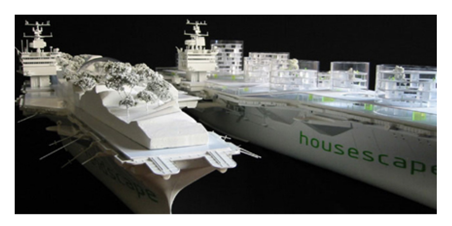
Figure 1: Micro-Utopie (iaN+ and Marco Garofalo, 2003).