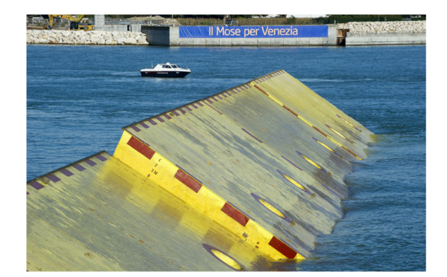
Figure 6: MOSE (MIT, 2003 – ongoing).