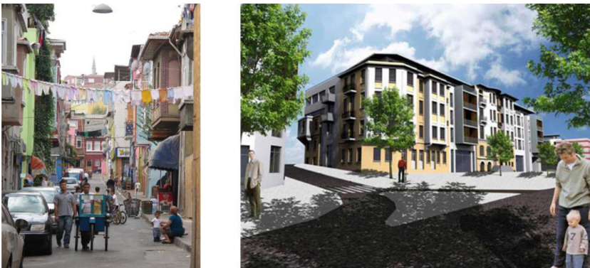
Figure 3: Existing neighborhood structure and proposed spatial project in historical district.