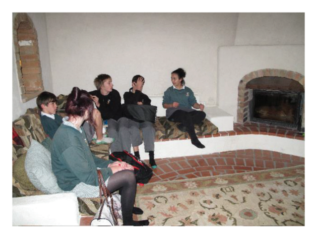
Figure 6: Environmental science students engaged in discussions in the house.