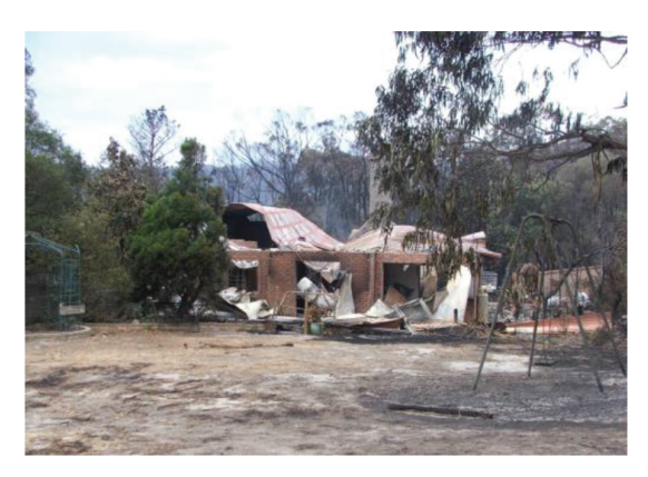
Figure 4: The original home destroyed in the bushfires.