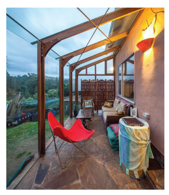
Figure 3: North-facing sunroom capturing warmth and sunlight.