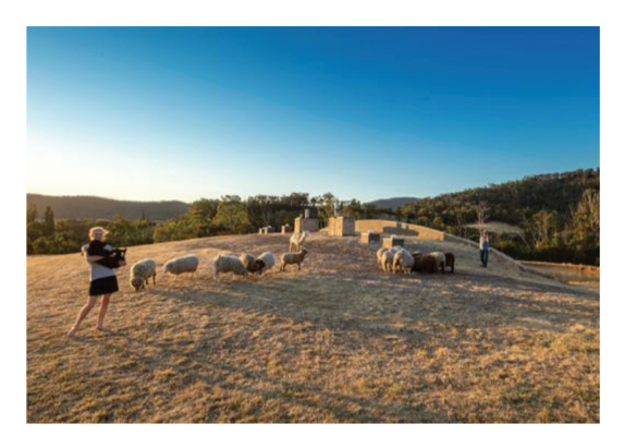
Figure 5: Sheep grazing on the roof of the new house.

Amanda and Edd wanted to rebuild a home that would not only resist fire as required by the Australian Standard AS3959 Construction of Buildings in Bushfire-Prone Areas [37], but also exceed it. While many people in their community rapidly replaced timber-framed housing identical to that lost in the fire, Amanda and Edd wanted to 'rebuild properly, not quickly' [38]. They wanted to build a home that they felt safe in with the knowledge that bushfires would likely affect the property again in their lifetimes, and to also provide an example for the community of a type of building better adapted to this environment (Fig. 5).