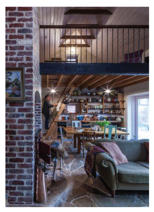
Figure 2: Kerry with her dogs in the compact living space.

materials and helped her maintain a sense of self. Kerry wanted to create a home that was more self-sufficient and offered opportunities to reduce her environmental impact. In addition to designing a beautiful, efficient and compact home of 55 square metres, the project team proposed a north-facing sunroom that initially was omitted from the scope of works due to concerns about the budget. As the project progressed, Kerry realised how the sunroom would provide an essential response to her values, capturing warmth and sunlight for use in heating, drying food and washing and to extend her small house with a light-filled living space that was connected to nature (Fig. 3).