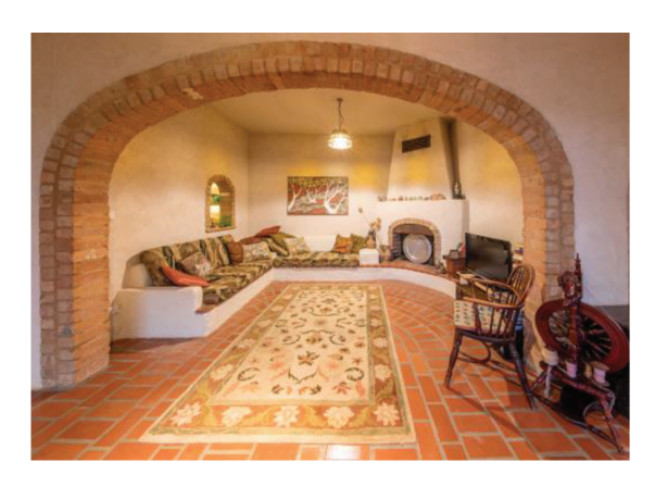
Figure 7: Arches constructed from bricks recycled from the original home.

potential fires by creating a large and easily defendable space. The project team proposed an earth-sheltered house to provide stable thermal performance, enhancing fire safety and lowering maintenance. By orienting the house to the sun, combined with its large thermal mass and enhanced insulation, the house maintains a year-round stable temperature range of 21–24 degrees Celsius with very little additional energy input. Amanda and Edd's core values included; education, sustainability, family, integration of buildings with the farm environment, security and identity. In response to this, the house produces its own water, treats its own effluent, and is extremely low maintenance through the use of durable materials. It has one façade exposed to the environment and all spaces easily accessible on one level. Arched openings throughout the house were made from bricks recycled from the burnt house, and reflected the same forms Amanda and Edd had experienced in the houses they grew up in, and the curved earth-sheltered roof was similarly designed to echo the sweep of the surrounding hills (Fig. 7). A practical brick-paved floor also created a sense of continuity with the home that had been lost, which had used similar materials. The new house facilitates a self-sufficient life, with sheep grazing grass on the roof, energy generated from wood and sunlight collected