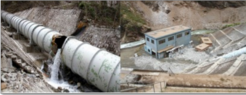
Figure 1: Damaged penstock pipe of Bhote Koshi hydropower plant (left) and Powerhouse submerged in soil and access roads blocked by landslides (right).

downtime of the plant. Consequently, it also causes hardship on the daily life of people who depend on that power plant.