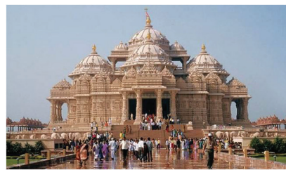
Figures 4 and 5: Traditional style and façade of the temple complex ( www.akshardham.com [1]).