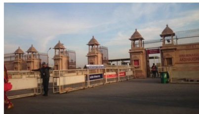
Figure 2 and 3: Boundary wall and gates to the temple complex.