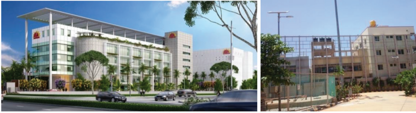
Figure 7 & 8: Data centre complex at Bengaluru – façade and fencing towards residential side.

to only codal compliance to structure, disaster and life safety. The glass is not ideal but still safe enough due to its compliance to green standards. The lamination makes it less dangerous. The granite stone on the façade and other façade finishing materials are regionally sourced but have a high potential to harm.