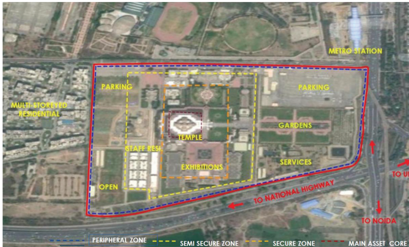
Figure 1: Satellite image of the Akshardham temple (maps [3]).

also add to the protective layer distancing from the side with unknown future development. Parking is strategically distanced from the secured core, on ground but detached.