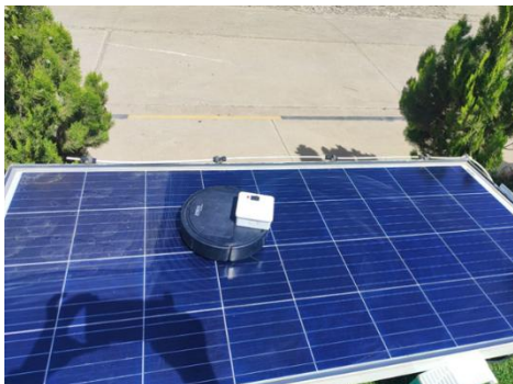
Figure 8. Very light soiling