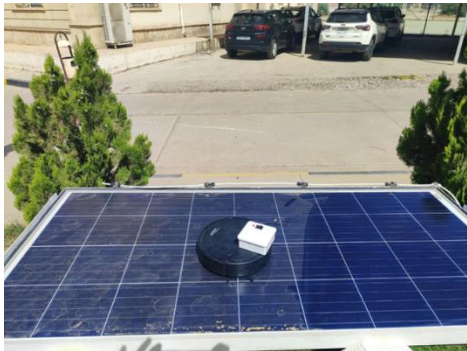
Figure 6. Moderate soiling