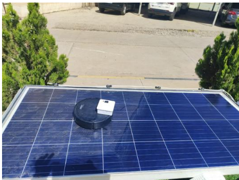
Figure 7. Light soiling