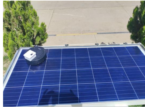
Figure 9. Cleanest condition