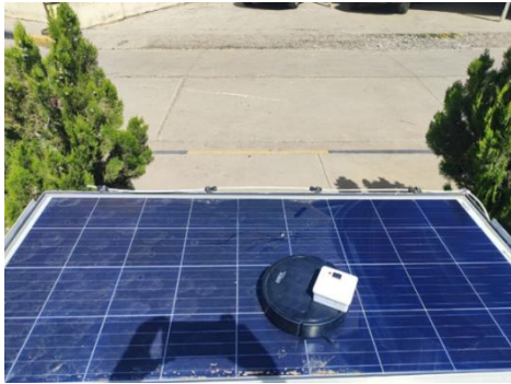
Figure 5. Heavy-moderate soiling