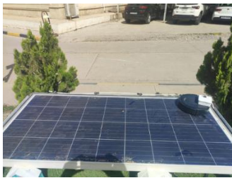
Figure 3. Solar panel with cleaning brush

The panel was colonized by a small, autonomous dust-removing robot, such that the panel could enable real-time dust mitigation in the field. Each of the panel-cleaning missions occurred under real dust, outdoor, and wind conditions, instead of a controlled lab. The results can, therefore, be used in real-life applications and avoid the limitations that laboratory data may introduce.