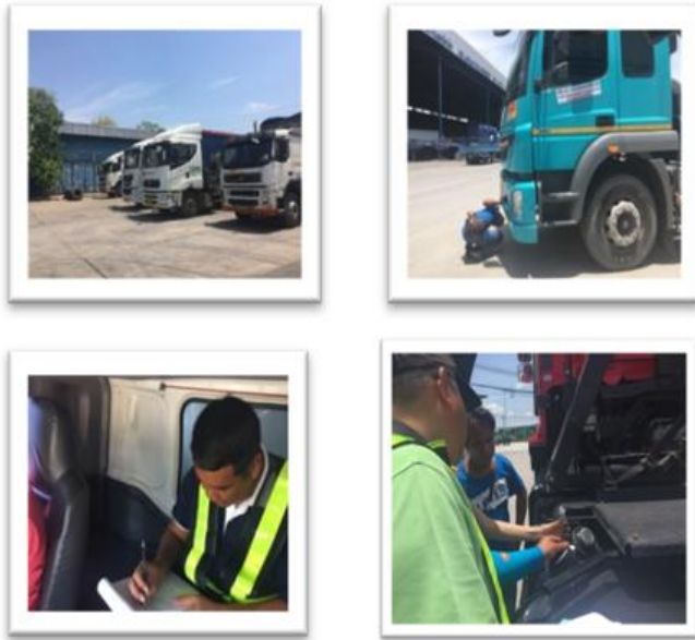
Figure 2. An eco-truck driving skills training exercise

A more robust assessment of the training program's effectiveness could be achieved by including a control group or employing a pre-test/post-test design.