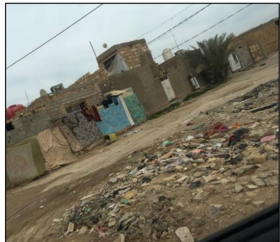
Figure 5. The deteriorating state of the housing construction in the Barrakia area