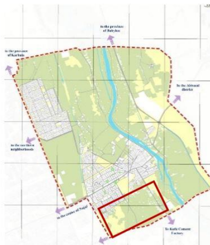
(A) Al-Barrakia in 2003