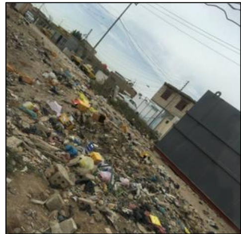
Figure 4. The spread of waste in the Barrakia area

Neighboring residents are disturbed by these behaviors because they experience inadequate services in general, as a result of pressure from offenders. Additionally, they feel fear and discomfort due to the presence of informal housing in their vicinity.