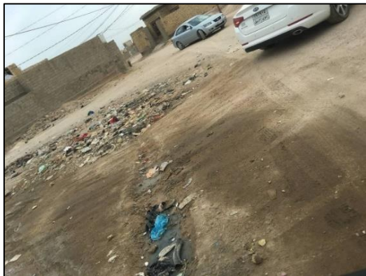
Figure 8. Streets in Al-Barrakia