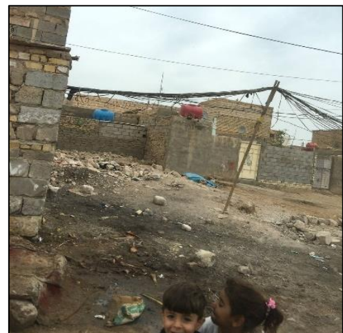
Figure 6. Infringement of infrastructure in the Barrakia