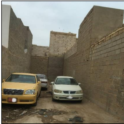
Figure 7. Personal transport cars in Al-Barrakia

We noticed that there are no lines for the public transport network, but there are some residential units whose owners' own vehicles (taxis) for work and some of them are personal transport (Figure 7). There are no regular streets neither straightening nor in the construction situation (Figure 8).