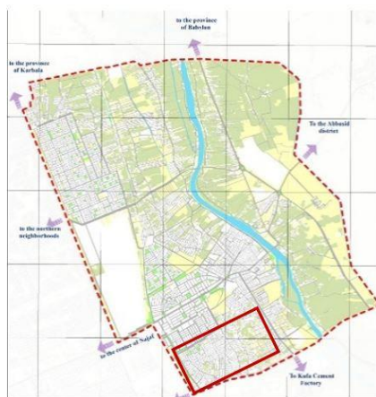
(B) Al-Barrakia in 2020