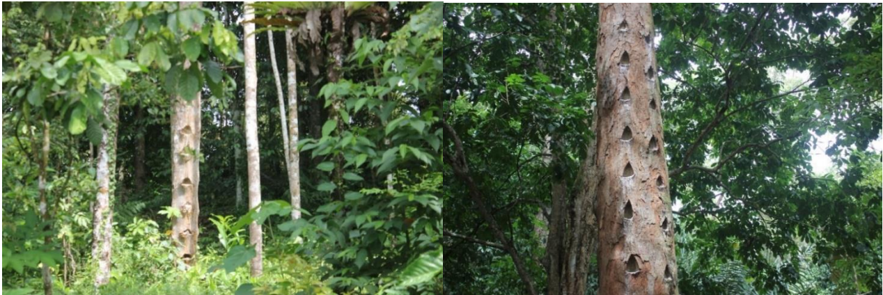
Figure 1. Shorea javanica stands

biodiversity [7]. In addition to resin, the research site also contains various flora and fauna. This is proven by various studies that found various types of flora in Repong Damar in Pesisir Tengah Subdistrict, Pesisir Barat Regency. Repong Damar stands can be seen in Figure 1.