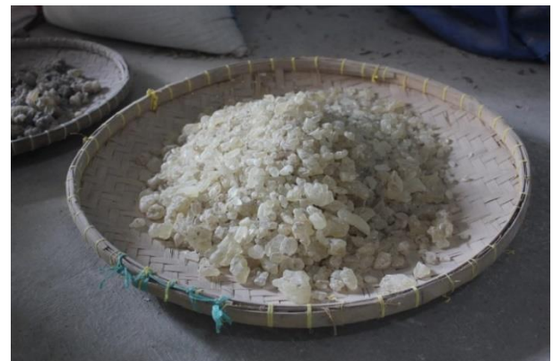
Figure 2. The outcome of resin extraction

culture. Regardless of these beliefs, the behavior and awareness of the community around Repong Damar in maintaining its sustainability is certainly higher and in accordance with local culture because they have a high dependence on forest products compared to people who live far from the forest. Repong Damar farmers in Penengahan Village have an average income from Repong Damar of Rp. 16,120,000/KK/year, income outside Repong Damar ranges from Rp. 4,200,000/KK/year to Rp. 24,000,000/KK/year and the average income per capita of the community in Penengahan Village is Rp. 5,169,200/person/year or Rp. 430,800/person/month [8]. Farmers' income is derived from the resin harvest (Figure 2).