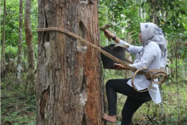
Figure 3. The process of harvesting resin sap

consideration of important and potential types for economic purposes and conservation of vegetation that needs to be conserved in a location including Repong Damar based on local socio-culture [16]. Traditional knowledge systems based on local socio-culture are very important in the context of vegetation resource conservation, utilization, and environmental management. It includes knowledge that needs to be recognized by the local communities, such as Figure 3, which shows the process of resin harvesting by the community.