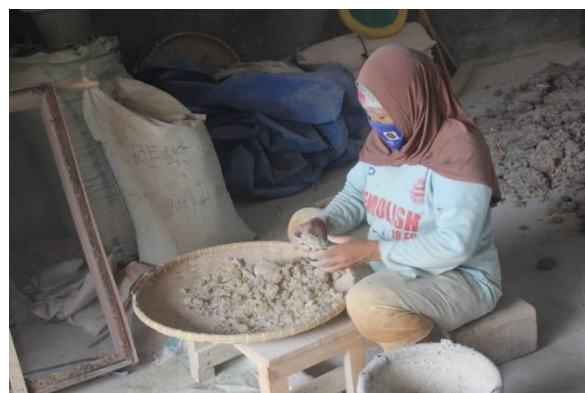
Figure 6. The processing of resin harvest

are owned by elderly generations, and it is proven that many farmers in the Repong Damar are elderly (>45 years). Then, it is supported based on the results of research [62], that the older generation of people aged 35 years and above have higher ethnobotany knowledge compared to the younger generation. As in Figure 6, which shows the processing of Repong Damar harvests carried out by the older generation community.