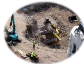
Figure 3. Backhoe accident

The Insurance returns to the owner a new equipment of USD ($) 90,000; 18 months after the accident.