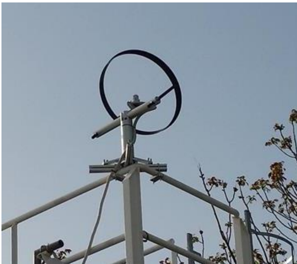
Figure 3. Sensor for measuring the horizontal diffuse illuminances.

In order to evaluate the real availability of daylight, the external values of the horizontal global and diffuse illuminance were acquired. Both horizontal illuminance values were acquired on the roof of the experimental station using two illuminance-meters LP PHOT 03 (manufactured by Delta OHM [31], with cosine correction, measuring range from 0 lx to 150,000 lx, relative spectral response ( f_l' ) < 6 % and accuracy < 4 %). The figure 3 shows the arrangement of the sensor for the measurement of the external horizontal diffuse illuminance values.