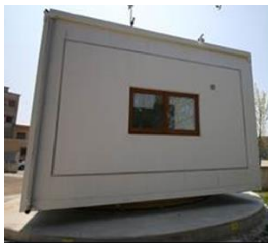
Figure 2. External view of the experimental station and window

Starting from the need for additional experimental and theoretical studies on full scale EC windows as well as to assess on-site the performances of all "smart" solution for windows, an experimental station was designed and set-up at the Department of Engineering of the University of Sannio. The station consists of a main supporting steel structure, with an external size of 6.00 m x 6.00 m and height of 5.50 m that support three removable and one not movable wall. The fixing systems of the removable walls and window were realised with the purpose of allowing their easy substitution, and then the characterization of different types of walls and windows. The cooling and heating control systems as well as the experimental data acquisition systems were installed on the not movable wall. Figure 2 shows the external view of wall where can be installed the window to test. The test facility structure was placed on a turntable with the purpose of adjusting the orientation of the experimental station.