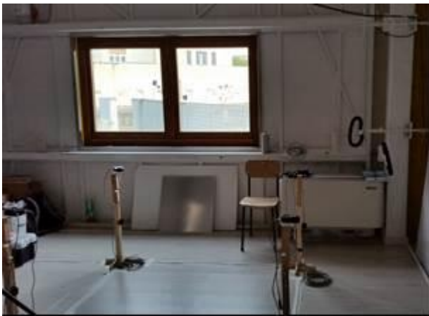
Figure 5. Internal view of the test room with positioning of the illuminance sensors