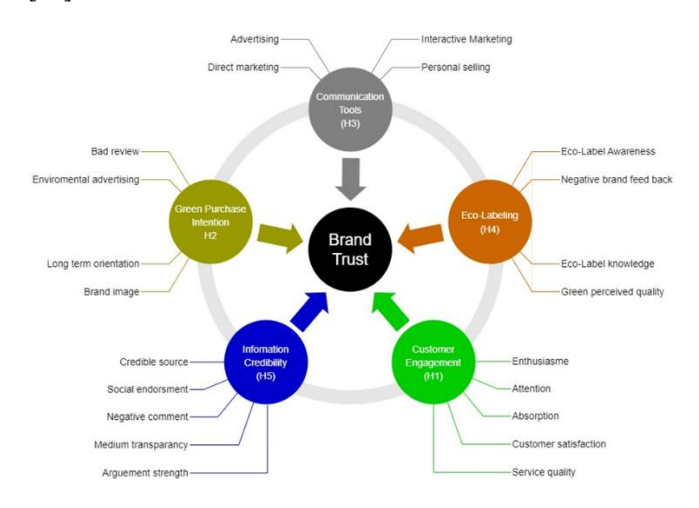
Figure 2. Initial IMBT

[30]. This suggests that when the price is high, the motive to write a bad review is greater [31]. consumers generate cognitions and connotations when they are exposed to advertisements, which affect their attitudes toward advertising as well as their perceptions about the company's image. A long-term perspective holds that buildings designed with an environmentally friendly approach can help to maintain a sustainable ecosystem. and the final one is the brand's image [32].