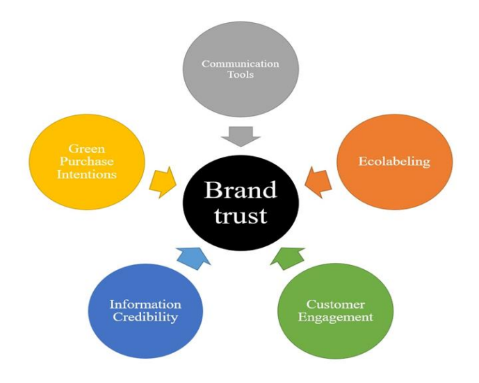
Figure 1. Conceptual IMBT

There are five model concepts that contribute to brand trust model as shown in Figure 1 which is combination model called as "Integration model of brand trust for green marketing". Hence, this research will provide novelty.