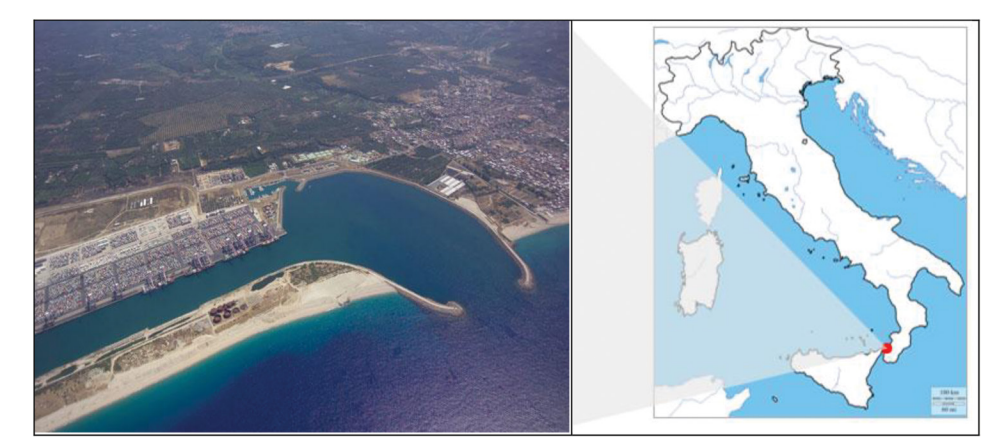
Figure 3: View of the port of Gioia Tauro

The connection of the port of Gioia Tauro with the Italian and European railway networks is an element of weakness. Today the port is connected to the national railway network through