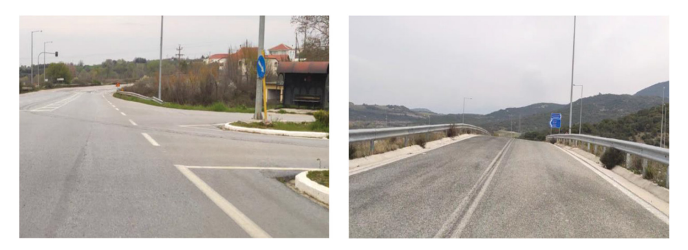
Figure 9: (a) Uncontrolled intersection and (b) intersection in vertical crest curve; limited visibility.