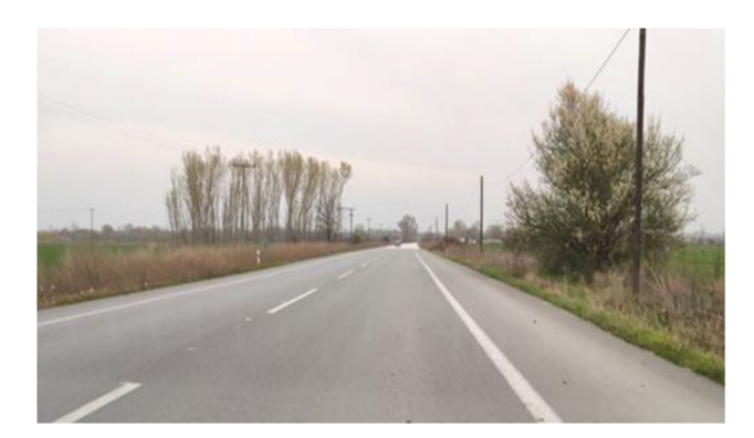
Figure 5: A combination of small radius vertical crest with horizontal curve.