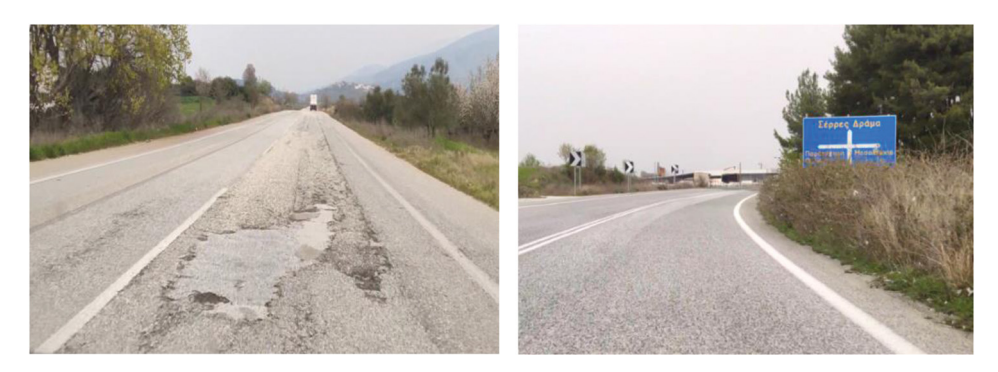
Figure 6: Lack of maintenance of pavement and signing.

Figure 5: A combination of small radius vertical crest with horizontal curve.