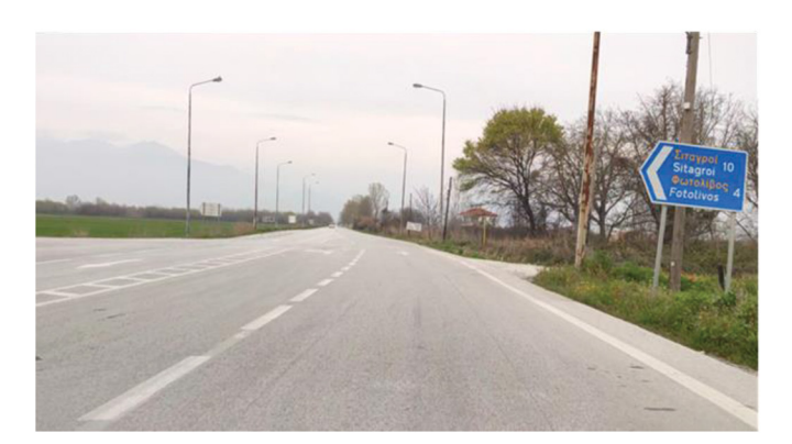
Figure 8: Roadside obstacles.