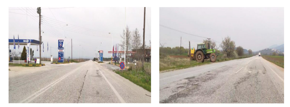
Figure 3: Uncontrolled access points.