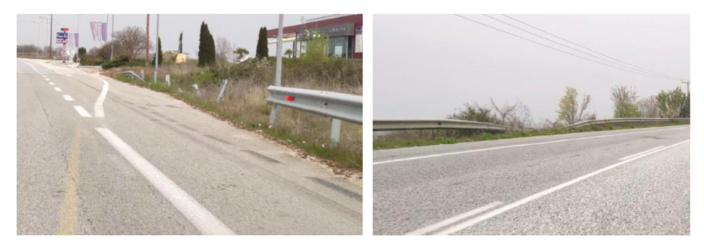
Figure 7: Damaged restrained systems.