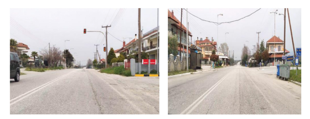
Figure 2: Road with mixed functions.

throughput of long-distance motorized traffic. The critical areas where the road passes through villages creates situations of mixture of functions (Fig. 2). There is no clear distinction between the flow function of the interurban road and the access function of urban road. In case the road geometry, from one environment to another, keeps unchanged, the driver behaviour has to be changed as may cause serious problems in road safety with conflicts with vulnerable road users.