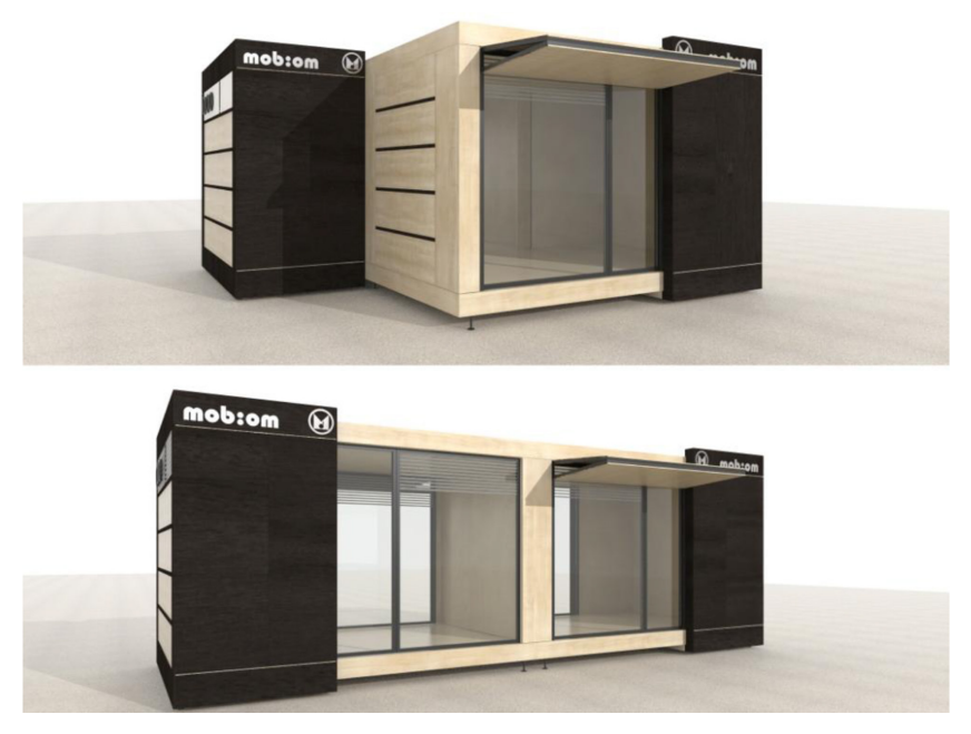
Figure 6: Different aggregative solutions.