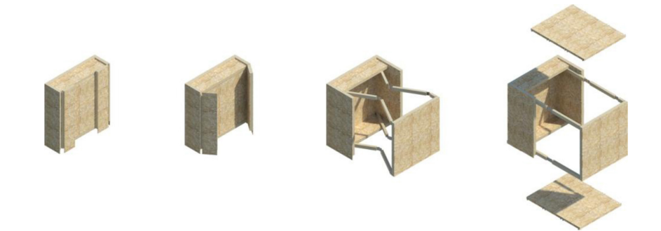
Figure 3: The opening system of the basic module.

The technological system was completed using wood-fibre isolation systems 100 mm thick between the uprights of the structural frame, covered outside with MDF Accoya wood panels.