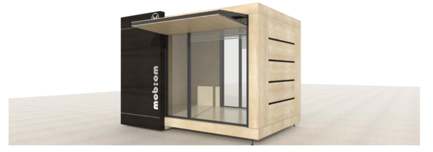
Figure 2: Photorealistic view of the project.

For the structure of the Mob:om we have opted for the wood as the predominant construction material, because of its excellent features and specific properties. It is an easily available