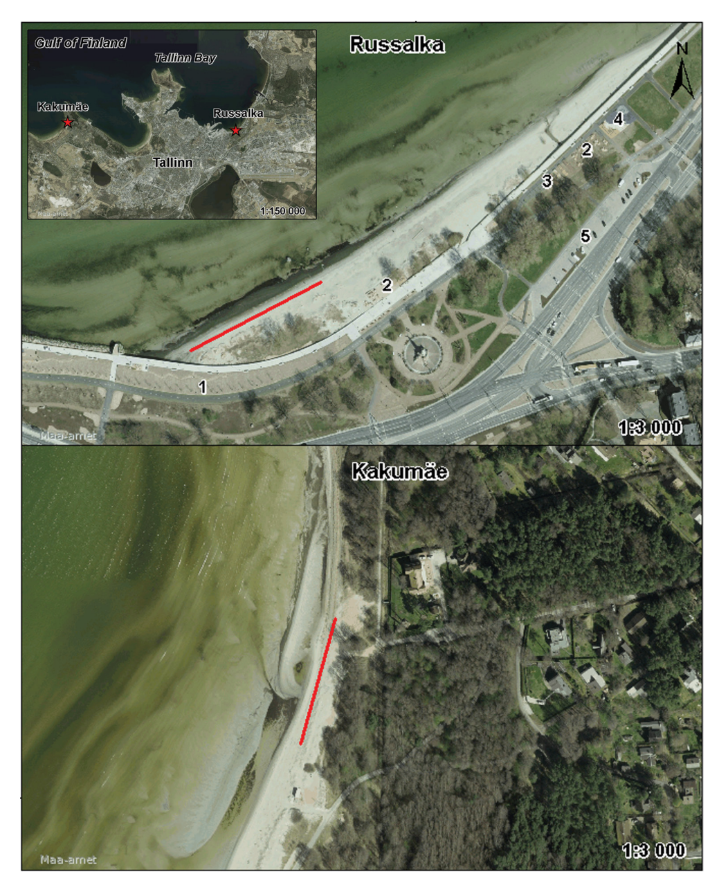
Figure 1: Location and the main facilities of the studied beaches. Sampling transects are marked with red line, 1 – seafront promenade, 2 – seating areas, 3 – sport facilities, 4 – children playground and 5 – parking lot.

from the waterline to the beginning of the vegetation. In this area, all the litter objects are counted and determined. The beach width ranged between 15 and 25 m in both sites. The minimum size of the longest side of the coastal macrolitter is set at 2.5 cm. This size also includes bottle caps and majority of cigarette butts [11].