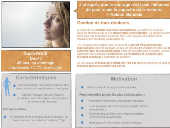
Figure 2. Person for the first class of patients