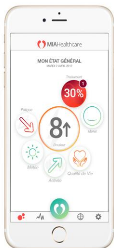
Figure 1. Main screen of the MIA Healthcare application

Within the framework of a user-centered design, our goal in this project is to provide tools to guide the design/re-design of such an application. In this way, end-user needs have to be identified/prioritized. In order to formulate design/re-design guidelines, we need to a) identify typical profiles and b) evaluate the user experience on the current MIA Healthcare application.