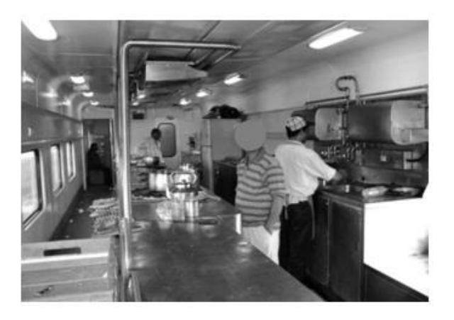
Figure 2. Air-conditioned pantry car kitchen

coach compartments are lighter than non-air-conditioned compartments [1].