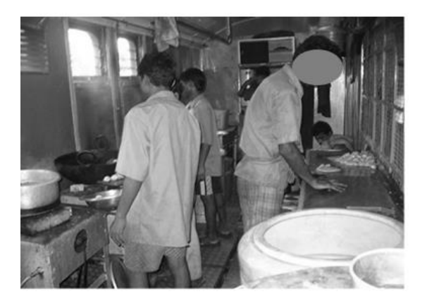
Figure 1. Non-air-conditioned pantry car kitchen

Figure 2 demonstrate the air-conditioned pantry car kitchen. This type of coach was established with the help of Germany in 1998, in Indian Railways and it was first introduced in some trains in 2000. At present, the number of pantry car coaches of this type is very low; it is available in only a few trains [2]. The worst problem in this type of pantry car kitchen is that it takes a lot of time to cook. And it does not make much food in it because it has an air-conditioned facility and it does not maintain its temperature. There are also 4 to 5 cooking chefs and 1 or 2 pantry car staff in this. The dimensions of airconditioned types of pantry car models are; length over buffer-24.0 (m), length over head-stock (body)-23.54 (m), width-3.24 (m), and height of the coach body-2.941 (m). Stainless steel material is consumed to fabricate these types of pantry car models [1, 4]. The carrying capacity of this type of coach model is 10% higher than other models. Models of this type of