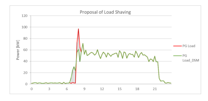
Figure 1. Possible effects of a Pre-cooling strategy applied to Polyvalent Group

The fluid distribution system of the building, considering both pumps and valves, allows to have a good control on the load in terms of flowrate requested. It could be possible both to act on the pumps of the different load utilities, controlling their operating speed and so managed flowrate, or on the load utilities valves. For the second case, the systems present a very good granularity that would allow a fine regulation of the load. For this first assessment, Figure 1 shows the expected results of the application of a supposed strategy with an observed reduction in load peak of 35 %.