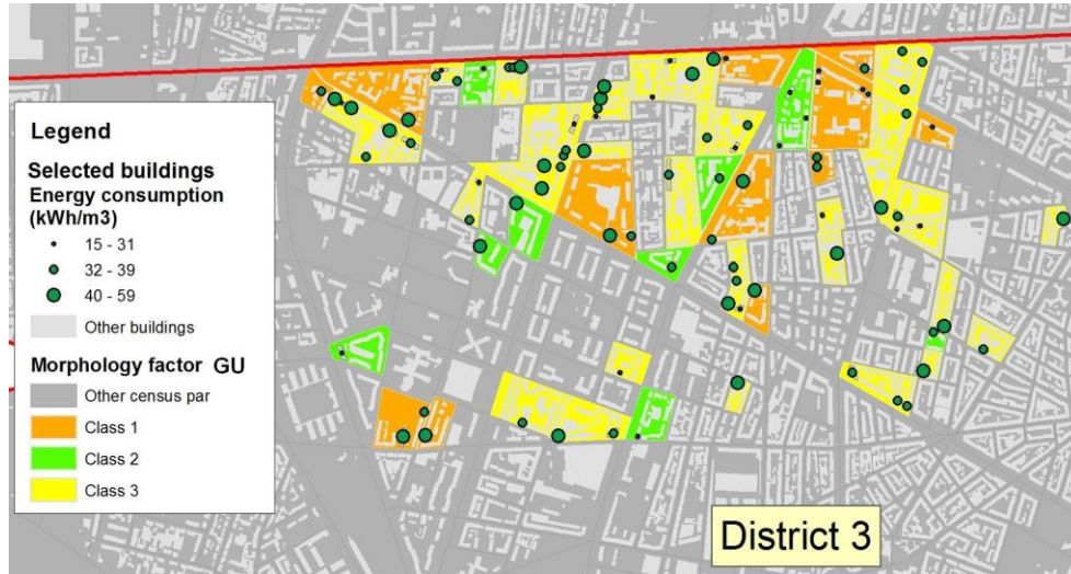
Figure 2. The energy-use for residential space heating and the urban Morphology classes

In Fig. 2 the map of the energy-use for space heating for the sample of the residential buildings in district 3 in the city of Turin is represented.