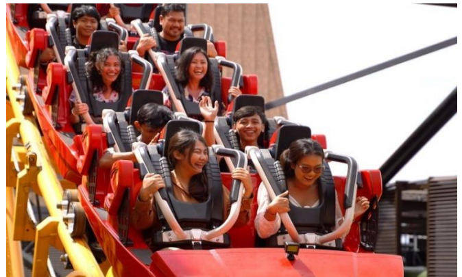
Figure 10. Trans Studio Bali Amusement Park, Denpasar City [14]

The attraction of Uluen Temple is located on the shores of Lake Bharatan. With a beautiful mountain backdrop, this towering temple is the most iconic photo spot for tourists. Visitors can also take a boat around the lake. To enjoy the beauty of this tourist attraction, the ticket price is IDR 30,000 for domestic tourists and IDR 70,000 for foreign tourists [1-5].