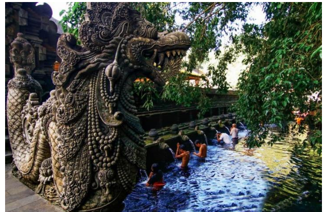
Figure 6. Temple of the Holy Spring, Gianyar Regency [14]

Apart from admiring the natural beauty, you can also try visiting Tirta Empul (Figure 6), a cultural tourist attraction located in Gianyar during your holiday. The name Tirta Empul itself means holy spring that radiates from the ground. Considering that the main function of the temple is as a place of worship for Hindus, you can visit the temple while purifying (melukat) with the temple's holy water. Apart from paintings, visitors can walk around the area and visit buildings and gardens typical of Balinese culture which look very beautiful.