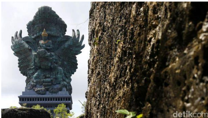
Figure 3. Garuda Wisnu Kencana, Badung Regency [14]

Kuta Beach (Figure 2) can be the best holiday destination in Bali because of its beautiful sunsets and ocean waves. In fact, it's not only busy on holidays, many tourists also flock to this beach on weekdays. Kuta Beach is a child-friendly area that does not require an entrance fee, so it must be included in your 2024 holiday itinerary [34].