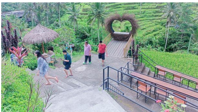
Figure 4. Tegallalang, Ubud, Gianyar Regency [14]

The next tourist attraction that is a shame to miss is Garuda Wisnu Kencana (Figure 3) or abbreviated as GWK. As the name suggests, GWK is home to the Garuda Wisnu Kencana statue, the fourth tallest in the world. The statue was designed by renowned local artist Nyoman Nuarta. To reach this magnificent statue, visitors will ride a buggy to explore the beautiful cliffs. On certain holidays, GWK often holds concerts or musical performances by local musicians [35].