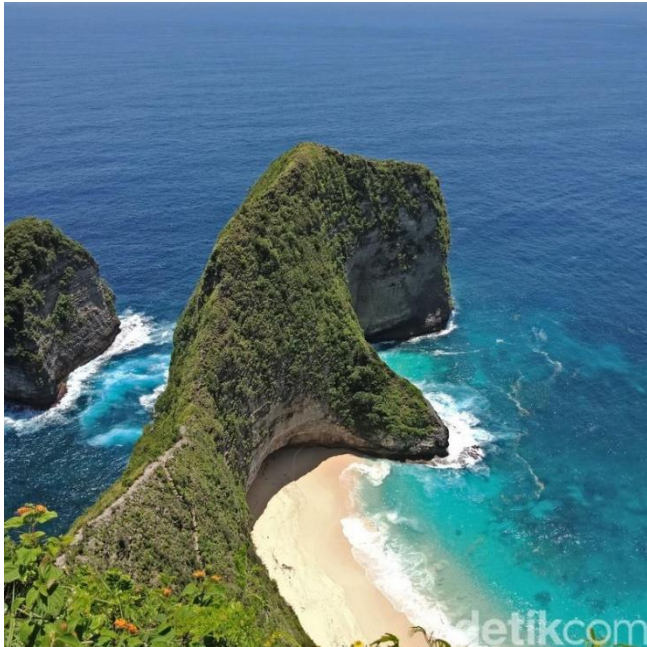
Figure 8. Kelingking Beach Nusa Penida, Klungkung Regency [14]

There's nothing wrong with enjoying the sunset around Campuhan Ridge Walk (Figure 7). This destination must be included in the list of recommended tourist attractions in Bali which are a shame to miss. Not without reason, there are many fun activities you can do. Starting from jogging or taking a leisurely walk accompanied by cool air and beautiful views, to cycling in the afternoon watching the beautiful panoramic sunset from the top of the mountain, to hunting for photos on Mount Campuhan. It should also be noted that this destination location is free to enjoy without paying any fees [39].