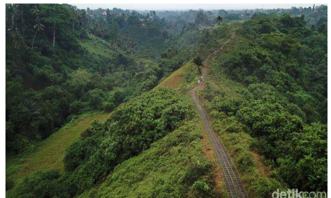
Figure 7. Campuhan Ridge Walk, Gianyar Regency [14]

To enter the Holy Spring Temple tourist attraction, tourists need to pay an entrance fee of Rs. 15,000. Pura Mata Air Suci is a Hindu temple and is a favorite destination for tourists in Bali. Located in central Bali, Manukaya Village, Taksilin District, Gianyar Regency. This temple is famous for its holy water and is a place where Balinese Hindus seek purification. Not only Hindus but tourists can also perform purification at the Holy Springs Temple [38].