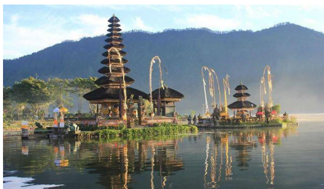
Figure 9. Ulun Danu Beratan Temple, Tabana Regency [14]

One of the iconic destinations in Bali that you can visit next is Kelingking Beach (Figure 8) in Nusa Penida. This beach is located in West Nusa Penida, Bali. The name Kelingking Beach itself comes from the appearance of this beach which looks like a little finger, although some say it looks like a Tyrannosaurusrex. On this beach, visitors can take selfies on the cliffs which show the beauty of Kelingking Beach. The entrance fee to Kelingking Beach is IDR 5,000 per trip [1-5].