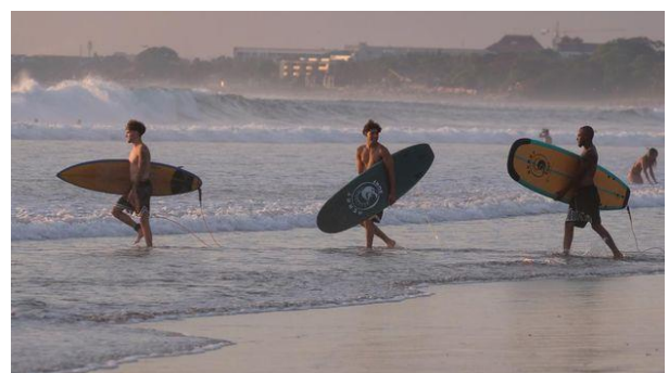
Figure 2. Kuta Beach, Badung Regency [14]

Bedugul Botanical Gardens (Figure 1) is a natural tourist park where you can picnic and relax with your family. The smell of cool mountains and cool air makes the start of the new year feel so peaceful and far from the hustle and bustle of the city. Also, there are still many interesting tourist attractions that you can visit, such as the orchid garden, cactus greenhouse, water park, and many more. To enter the Bedugul Botanical Gardens there is an entrance fee of IDR 30,000 [33].