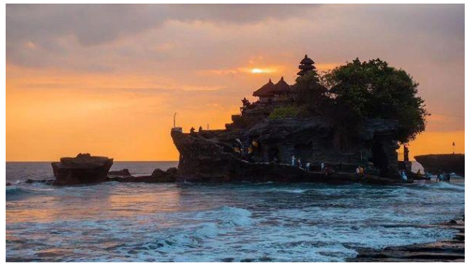
Figure 5. Tanah Lot Temple, Tabanan Regency [14]

Tanah Lot (Figure 5) is one of the destinations that must be visited if you want to vacation in the Tabanan-Bali area. Tanah Lot is considered to symbolize Balinese romance because of the beauty of the temple's silhouette at sunset. Even though it is famous for its sunset views, there is no harm in visiting this place in the morning to feel the calm of the morning sea. Tanah Lot ticket prices currently start from IDR 15,000 for domestic tourists and IDR 30,000 for foreign tourists. Tanah Lot is approximately 30 kilometers from Ngurah Rai Airport [37].