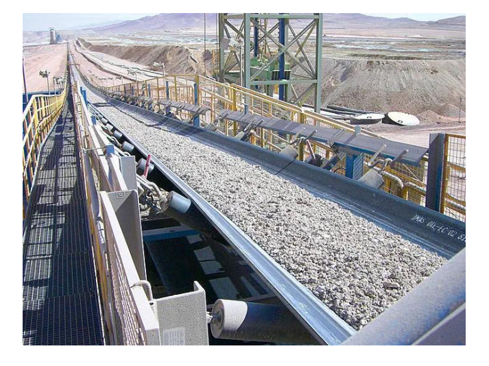
Figure 2. Belt Conveyor in Bir El Ater Mine, Algeria

The current research was carried out at the open pit phosphate mine operated by Bir El Ater company in southeast Algeria. The ore is transferred from the loading hopper via the conveyor belt (Figure 2). The conveyor belt's statistical data has shown how successful the new hybrid FMEA model that has been developed is.